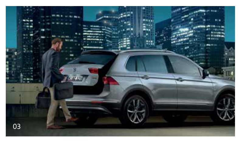
01 & 02 Air Care 3 zone autoomatic climate control with allergen filter and air cleaning function

*Leather appointed seats have a combination of genuine and artificial leather, but are not wholly leather.