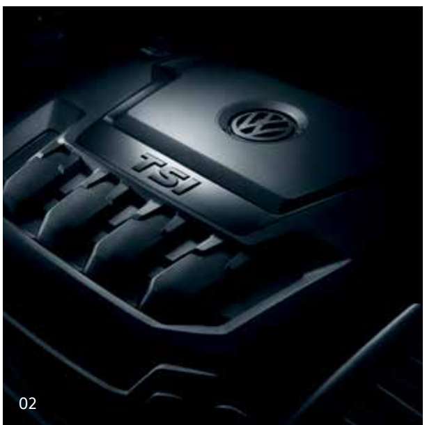
01 4MOTION Active Control all-wheel drive 02 132TSI Engine