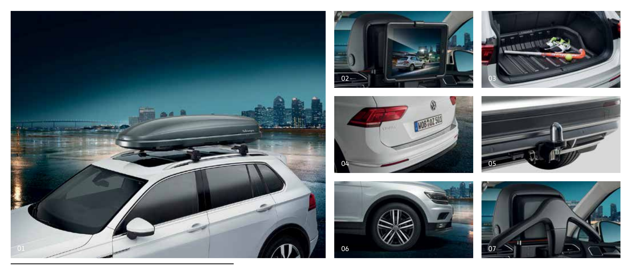
Overseas models are shown for illustrative purposes only. Optional accessories, at extra cost. Please note that the above accessories may have an effect on fuel efficiency. Items such as sports equipment are for illustration purposes only and are not available for purchase from Volkswagen Group Australia or its dealers. For a full range of Volkswagen Genuine Accessories, please visit an authorised Volkswagen Dealer.

01 Roof bars with roof box 02 Tablet holder 03 Loadliner 04 Loading sill protection plate 05 Towbar kit 06 19" Auckland alloy wheel 07 Coat hanger