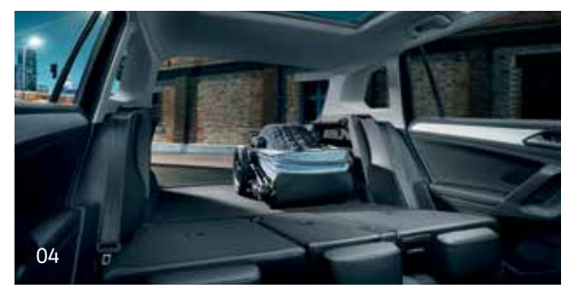
01 Direct Shift Gearbox (DSG) 02 Frameless rear view mirror 03 Discover Pro 9.2" infortainmennt system with Satellite Navigation 04 Luggage Capacity