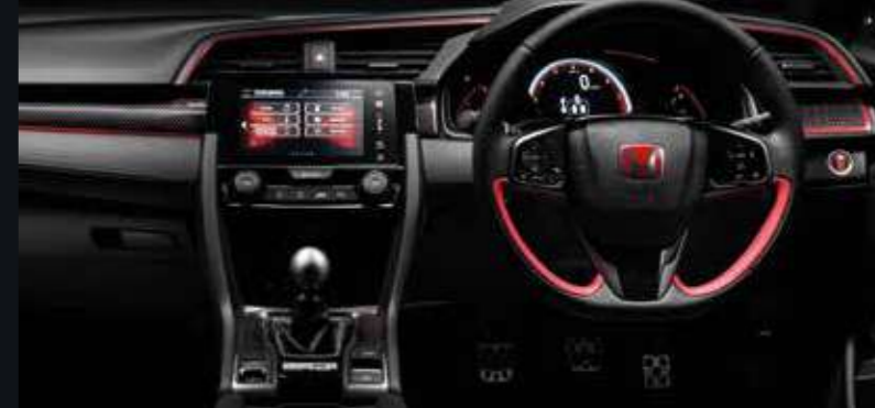
Interior carbon kit