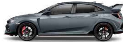
Sonic Grey (Pearlescent)*