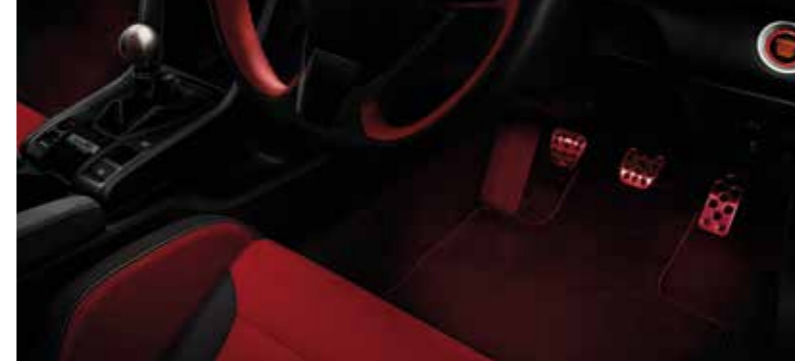
Foot lighting set – red