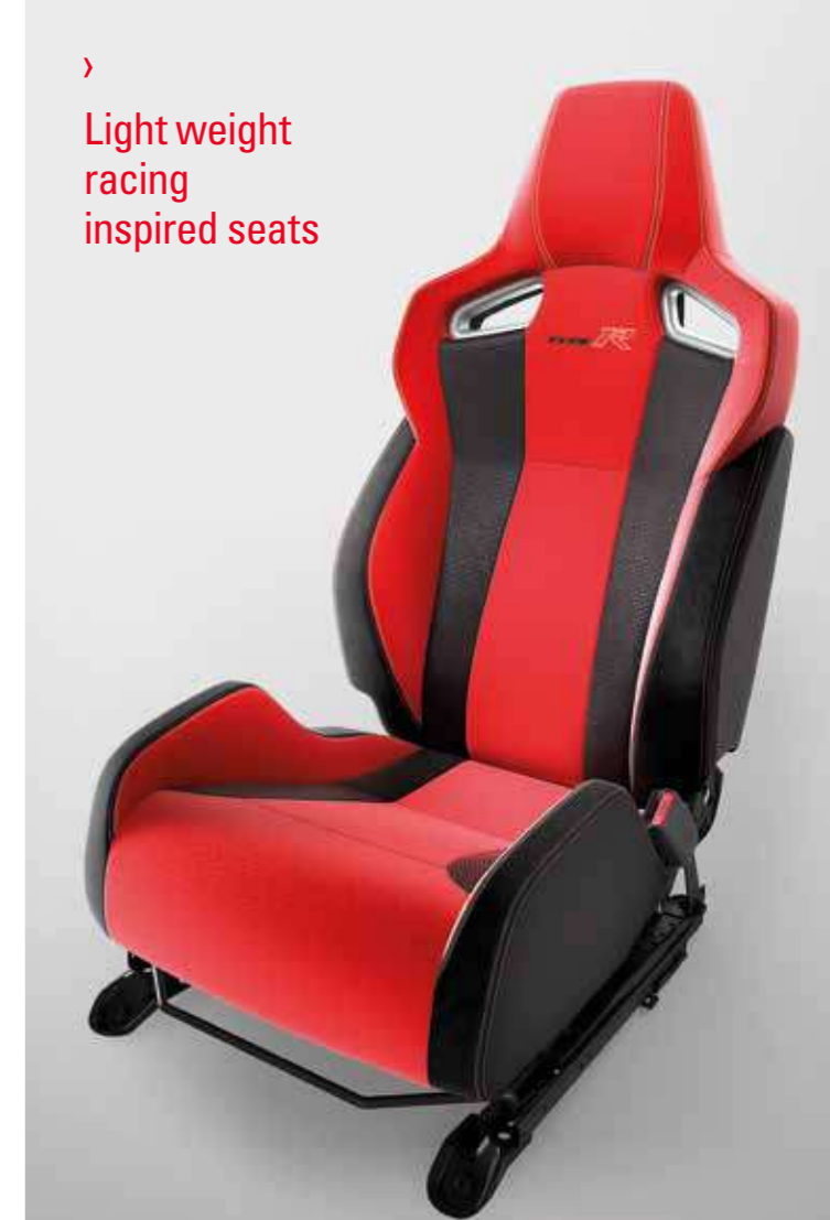
Light weight racing inspired seats