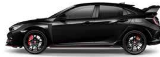
Crystal Black (Pearlescent)*