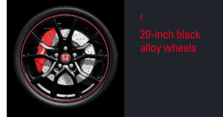
20-inch black alloy wheels