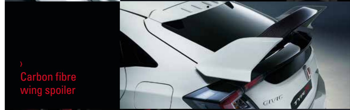
Carbon fibre wing spoiler