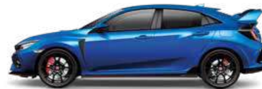
Brilliant Sporty Blue (Metallic)*