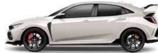
Championship White (Premium)*