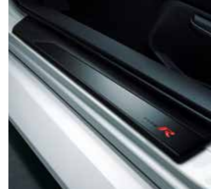
Illuminated door sill garnish set