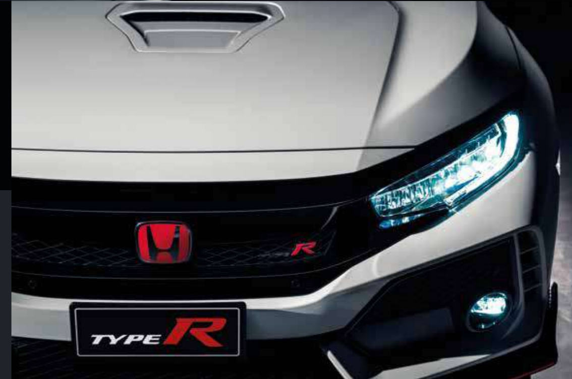
LED headlights and fog lights

At the rear, the signature Type R wing works in conjunction with vortex generator fins on the roof line, diverting air flow over and away from the rear of the car, helping to reduce the overall drag coefficient.