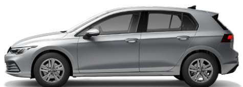
Reflex Silver M (Excluding R-Line)