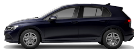
Atlantic Blue M