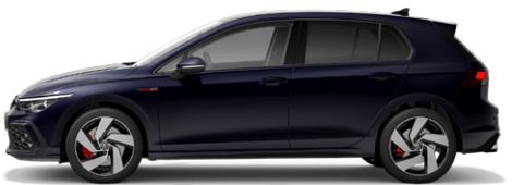
Atlantic Blue M