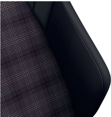
'Scale Paper' Black/Red Sports cloth seat upholstery