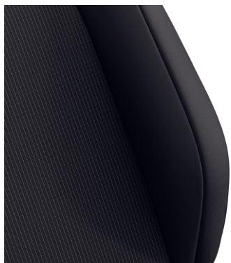
Golf - Standard Seats Cloth