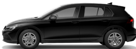
Deep Black PE