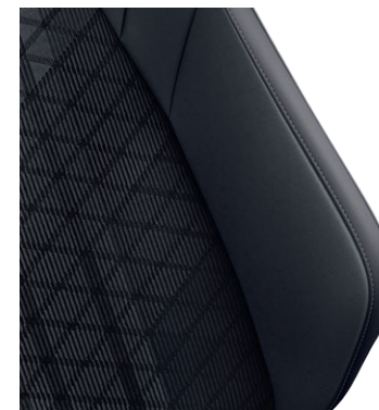
Golf Life - R-Line Sports cloth-Microfleece

Please note that Metallic, Pearl Effect, Premium and Premium Metallic paint are optional at extra cost. The print process does not allow for exact reproduction of the exterior or the upholstery colours. Please contact your Volkswagen Dealer for further information on colours and upholstery combinations.