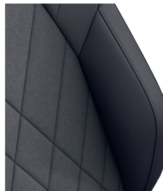
Golf Life - Comfort sport seats (Optional) Microfleece-cloth