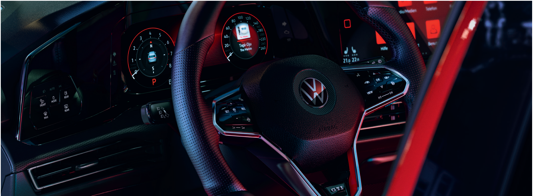
Overseas model shown. Local specifications may vary.