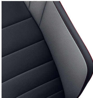
Black Vienna Leather appointed seat upholstery #

# Leather appointed seats have a combination of genuine and artificial leather, but are not wholly leather.