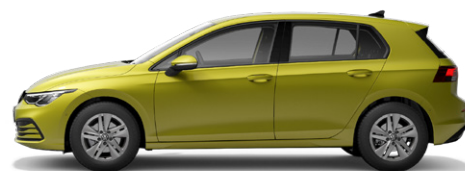
Pomello Yellow PM