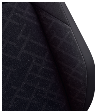
Golf Life - Comfort Seats Comfort cloth