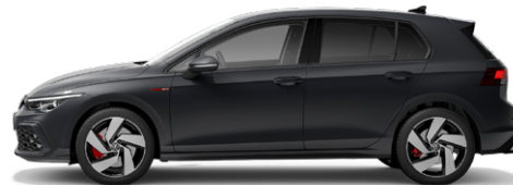
Dolphin Grey M