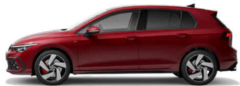
Kings Red PM