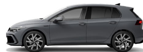
Moonstone Grey P (R-Line)