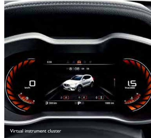
Virtual instrument cluster

Open up with one of the largest panoramic sunroofs in the small SUV segment for added elegance, luxury and viewability.