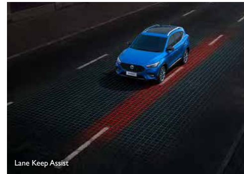
Lane Keep Assist