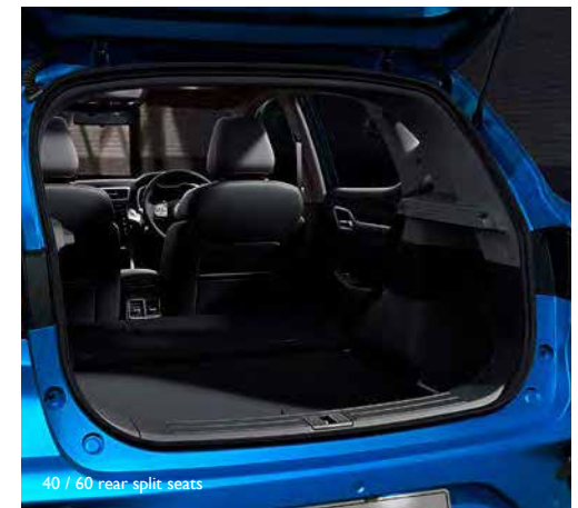
40 / 60 rear split seats