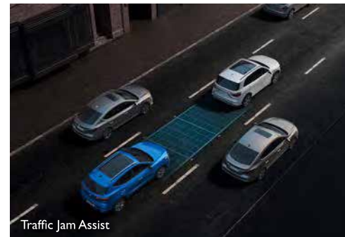
Traffic Jam Assist