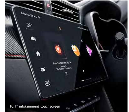
10.1" infotainment touchscreen