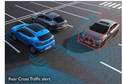
Rear Cross Traffic alert