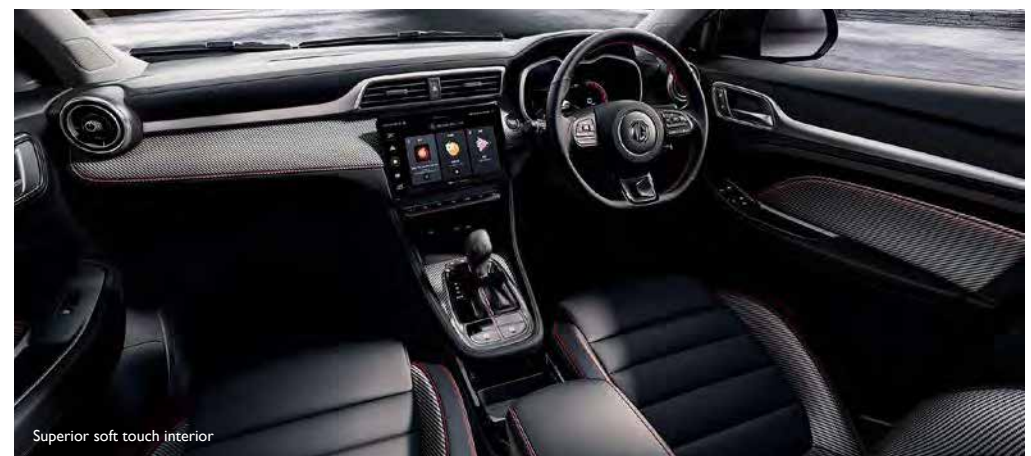
Superior soft touch interior