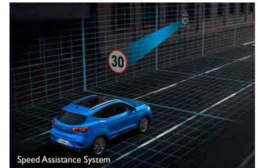
Speed Assistance System