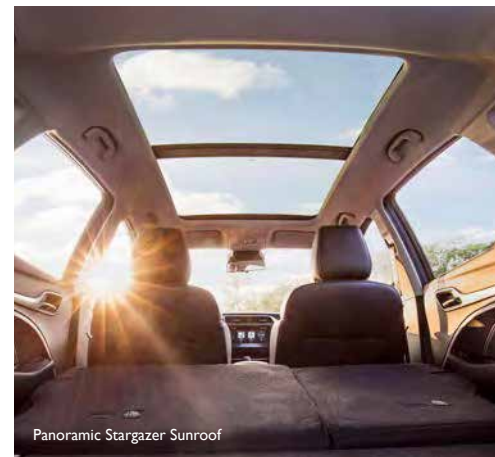
Panoramic Stargazer Sunroof