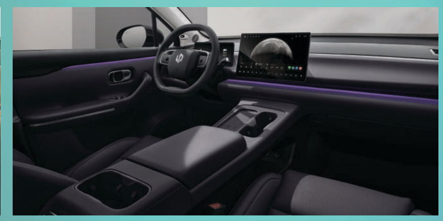
Camel Brown Style BEV (0HV) / Design BEV (0HW) Style REEV (0HZ) / Design REEV (0JA)