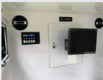
Internal multimedia system with 17 inch LED Monitor