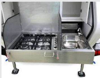
Full Kitchen with 4 burner cooker at rear