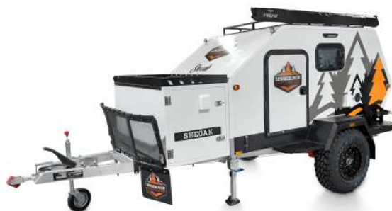
* Sleeps up to 4 with additional rooftop tent.

Coming with a large front toolbox with a fridge slide, storage cupboards, built in kitchen unit & multimedia system with 17" screen, you'll be left wondering what else to take with you.