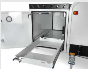
New designed front toolbox for storing a camping fridge