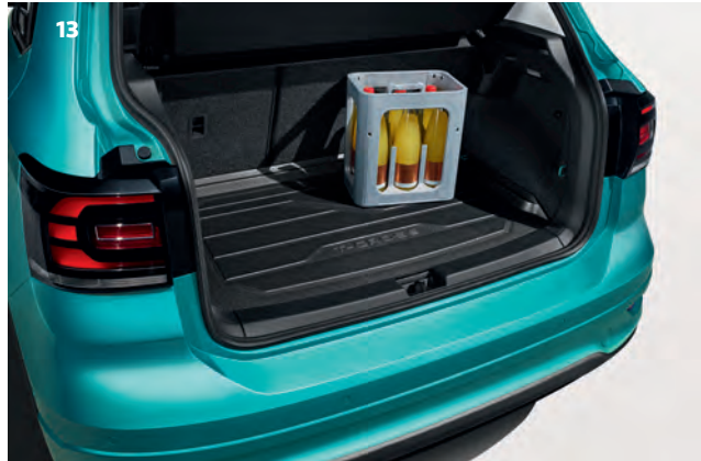
13 Luggage compartment tray A perfect fit: Can be wiped clean and is acid-resistant, the robust and durable luggage compartment tray with T-CROSS lettering easily keeps your luggage compartment clean.