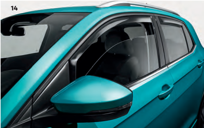
14 Slimline weathershields Enjoy the circulating fresh air, even when it is raining or snowing, or avoid the unpleasant build-up of heat on hot days by opening the windows slightly. Front: Part.no 2GM072193 Rear: Part.no 2GM072194