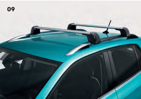
09 Roof Bars The genuine roof bars provide the base for all roof attachments and are aerodynamically designed to suit the T-CROSS. Load capacity: 70kg Part.no 2GA071151A