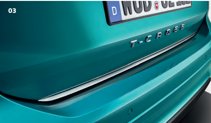
03 Tailgate protective strip The protection strip in high-gloss chrome protects the tailgate edges and adds to the appearance of the vehicle. Part.no 2GM071360