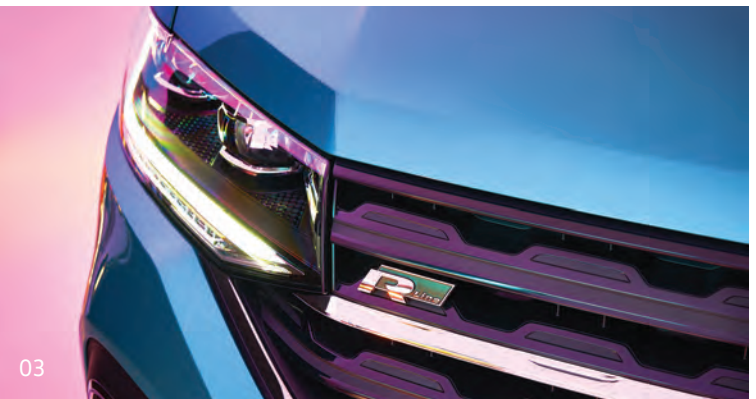
01 Optional Sound & Vision package shown 02 Optional 18" Nevada alloy wheels 03 Optional R-Line package shown