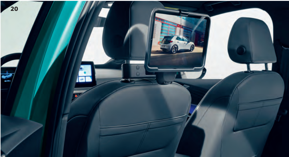
20 Tablet Holder The Volkswagen innovative Travel & Comfort system has a basic module that is simply fixed between the front seat headrest mountings and can be used with various tablet holder attachments which brings comfort and convenience to any journey. Please contact your local Volkswagen dealer for compatible devices.