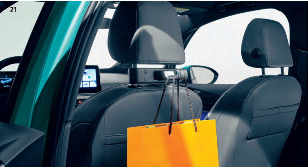
21 Bag Hook Part.no 000061126B