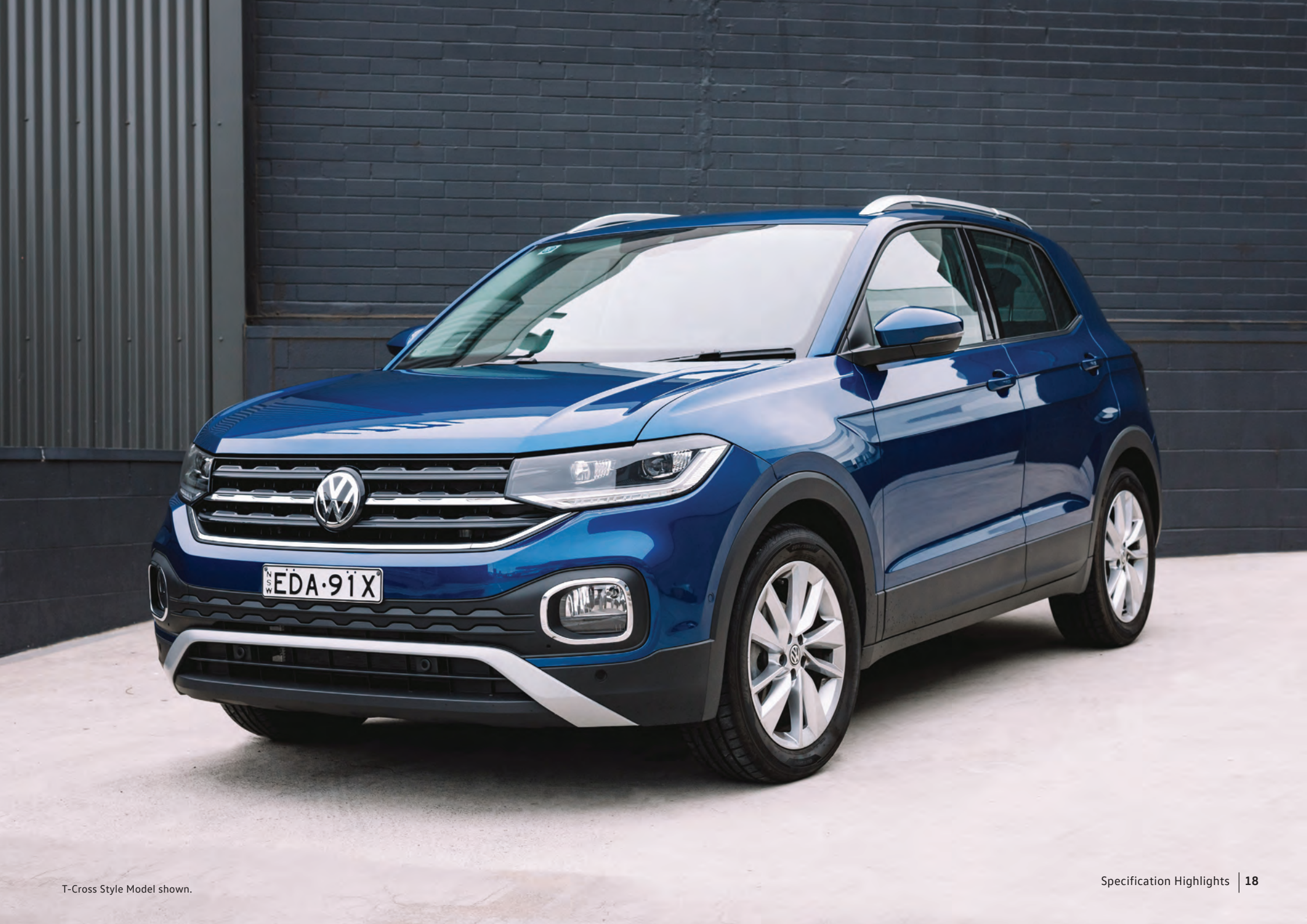
T-Cross Style Model shown.