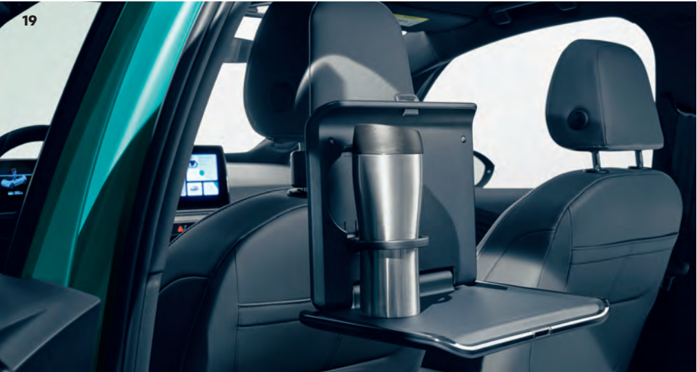
19 Folding table with cup holder The Volkswagen folding table with built-in cup holder is especially useful on long journeys and offers the rear passengers a practical surface with height and angle adjustment.