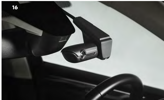
16 Universal Traffic Recorder Front: 000063511D Front & Rear: 000063511E