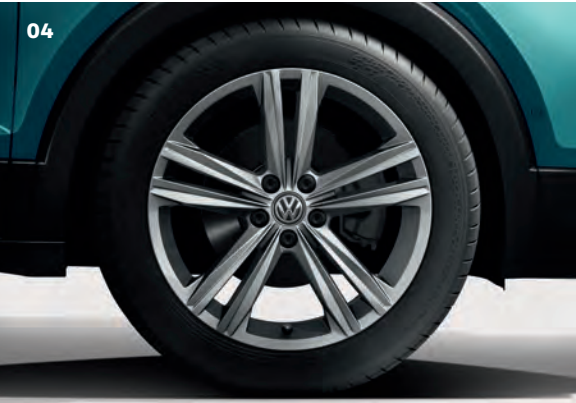
04 Sebring alloy wheel 17" Sebring wheel in grey mettalic finish. Part.no 2GM071498FZZ