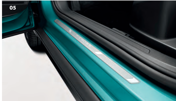
05 Door sill protection plate The high-quality aluminium door sill plates with T-Cross lettering not only protect the heavily used entrance area but adds a more premium look to your vehicle. For the front. Part.no 2GM071303