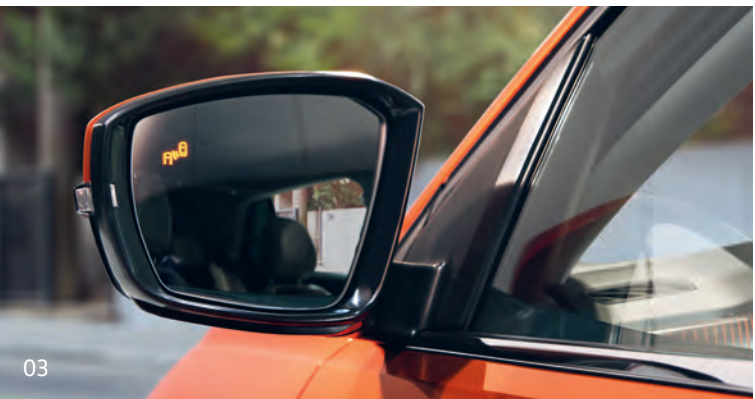
01 App-Connect~ featuring Apple CarPlay® 02 Centre console with wireless charging 03 Blind Spot Monitor*