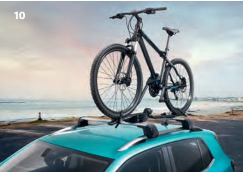
10 Bicycle carrier The aerodynamic bicycle holder has a quick-fastening system that makes it easy to fit and can be locked for piece of mind. Part.no 000071128F