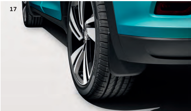
17 Mudflaps Front: Part.no 2GM075101 Rear: Part.no 2GM075111