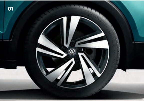
01 Nevada alloy wheel 18" Nevada wheel in gloss machined look. Part.no 2GM071497Z49