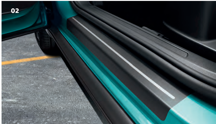
02 Door sill protection film A detail which is both sensible and functional to protect the heavily used door sills in the front and rear entrance areas against scratches and damage. Part.no 2GM071310