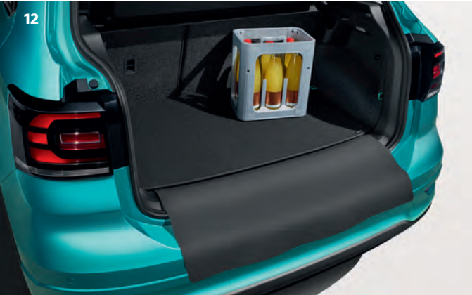
12 Reversible luggage compartment mat The perfectly fitting, reversible luggage compartment mat helps out when you have sensitive, dirty or damp goods to take. You can choose from soft and gentle velour on one side or sturdy, anti-slip plastic nubs on the other. To make things even easier, a built-in protective cloth can be folded out from the reversible mat to help avoid scratches to the loading sill when you're loading and unloading.