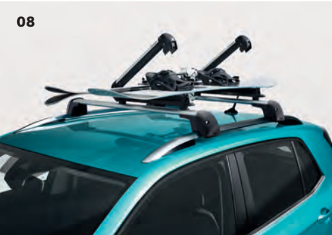
08 Ski and snowboard carrier When it comes to top of the mountain, there's nothing better on top. You can take up to six pairs of skis or up to four snowboards on the roof of your vehicle, comfortably and safely. The lockable ski and snowboard holder can quickly be mounted on the roof bars and is easy to operate.