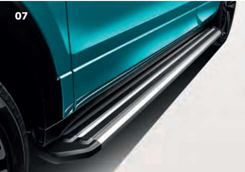
07 Side Steps Part.no 2GM071691