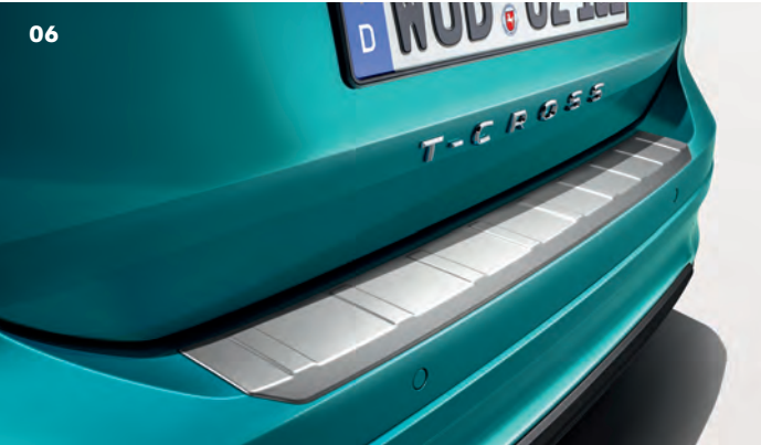
06 Loading sill protection plate The loading sill protection in stainless steel provides instant, stylish protection for an even more premium look to your vehicle. Part.no 2GM061195