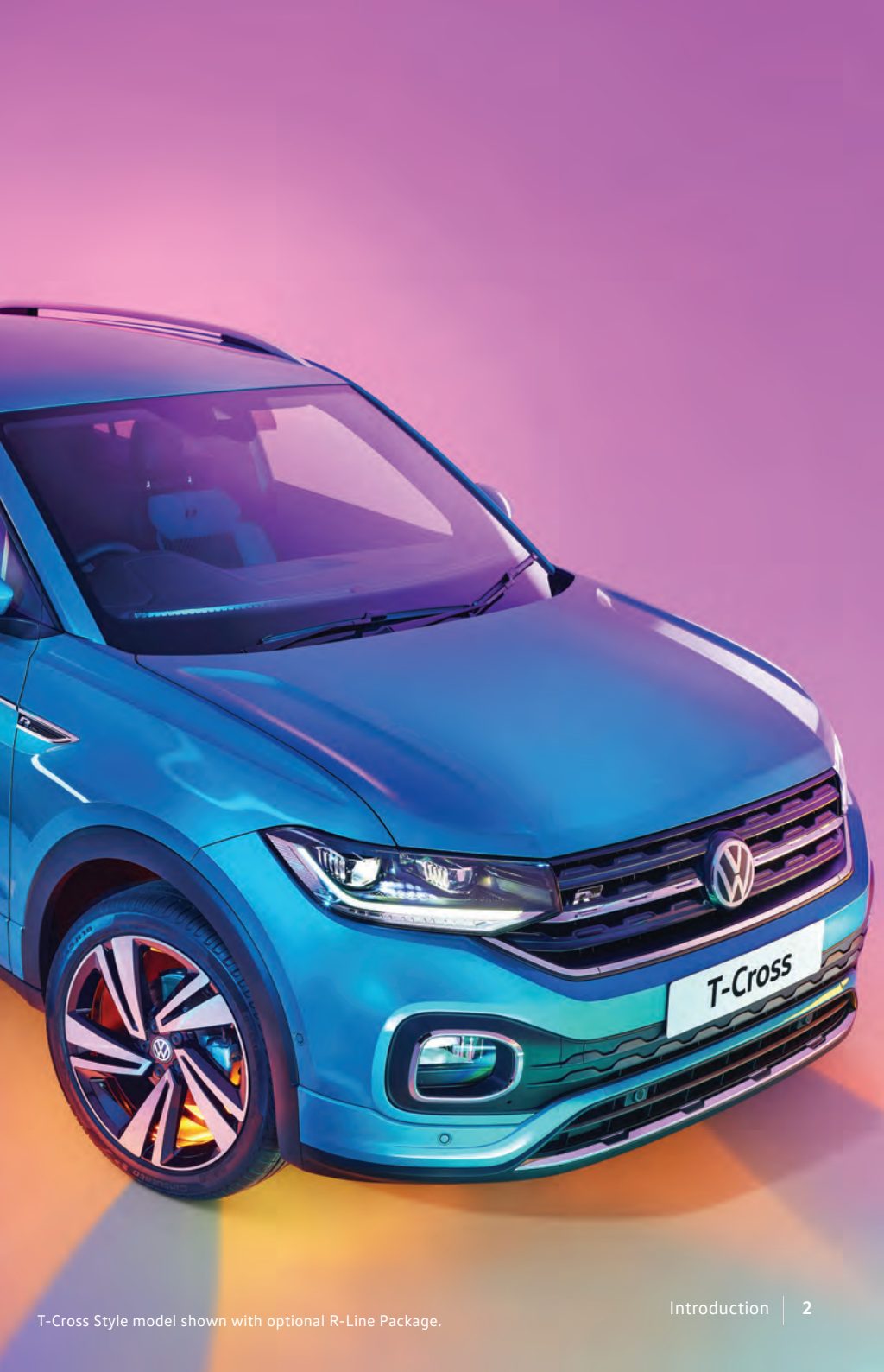
T-Cross Style model shown with optional R-Line Package.

Good things come in small packages. And the T-Cross offers plenty of proof.