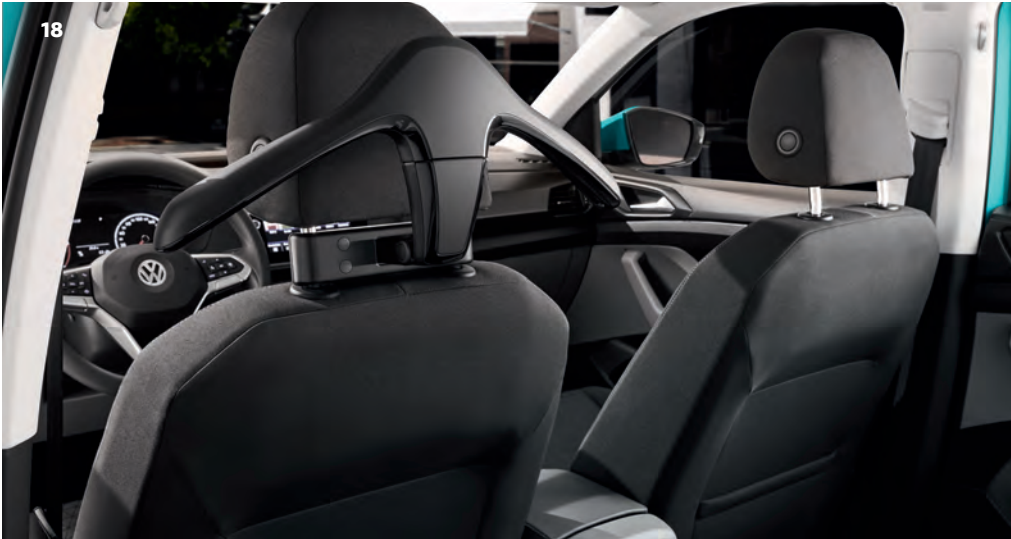
18 Coat Hanger Meet your business needs. The Volkswagen coat hanger provides crease-free transport of your clothing with a removable function as well.