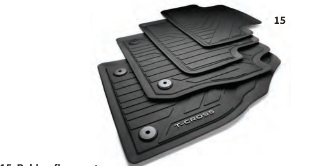
15 Rubber floor mats Keeping the footwell clean all year round: The perfectly fitting and durable floor mat set with T-Cross lettering on the front mats are attached to the vehicle floor using the integrated fastening system to prevent slipping. Front: Part.no 2GN06150282V Rear: Part.no 2GM06151282V