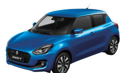
Speedy Blue Metallic (ZWG)