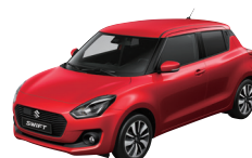
Burning Red Pearl Metallic (ZWP)