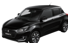
Super Black Pearl (ZMV)