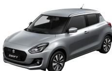
Premium Silver Metallic (ZNC)