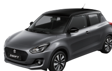
Mineral Grey / Super Black Pearl (CWD)