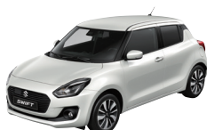
Pure White Pearl (ZVR)

* Apple Carplay® is a registered trademark of Apple Inc.