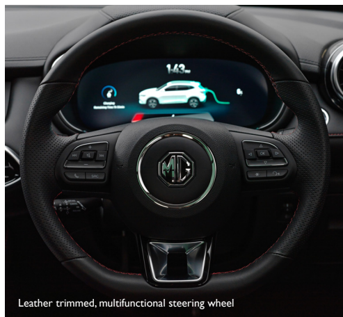
Leather trimmed, multifunctional steering wheel