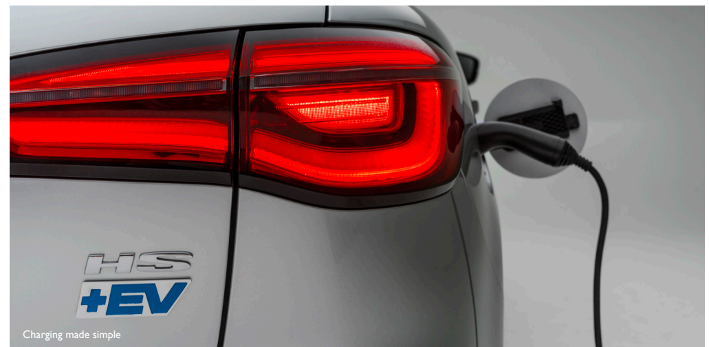
Charging made simple