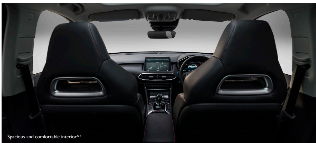
Spacious and comfortable interior ^!