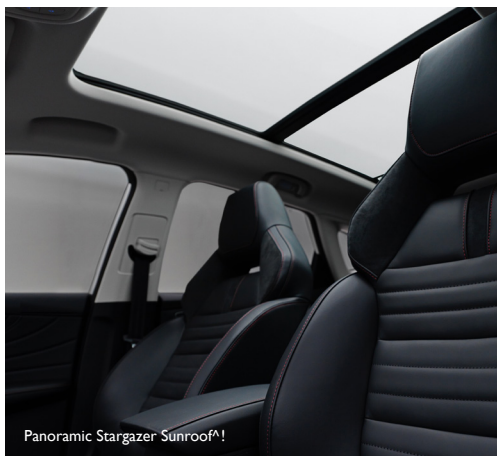
Panoramic Stargazer Sunroof ^!