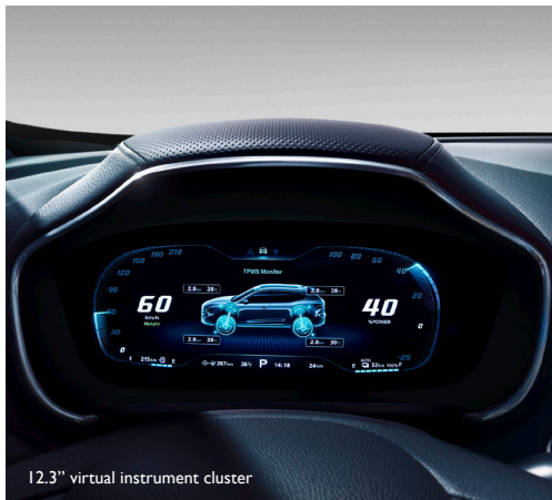
12.3" virtual instrument cluster