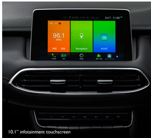
10.1" infotainment touchscreen