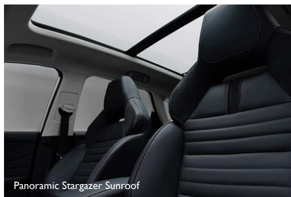
Panoramic Stargazer Sunroof

*Range figures are determined by testing under standardised laboratory conditions to comply with ADR 81 / 02. These figures should only be used for the purpose of comparison amongst vehicles. Actual figures will generally differ under real world driving conditions and will vary depending on factors including (but not limited to) driving style, vehicle's equipment and road, traffic and weather conditions. Provisional data at time of going to print. ^ Charging times can vary depending on many factors including but not limited to environmental conditions, auxiliary consumables (e.g. seat heating and air-conditioning) and capabilities of charging infrastructure capacity and/or supply. ~ Figures according to ADR 81/02 derived from laboratory testing. Factors including but not limited to driving style, road and traffic conditions, environmental influences, vehicle condition and accessories fitted, will in practice in the real world lead to figures which generally differ from those advertised. Advertised figures are meant for comparison amongst vehicles only.