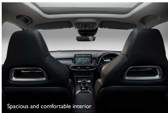
Spacious and comfortable interior

Proving that power and economy aren't mutually exclusive, the MG HS Plus EV has an impressive fuel consumption of 1.7L/100km ~ and combined CO2 emissions of just 39 grams per kilometre ~ .