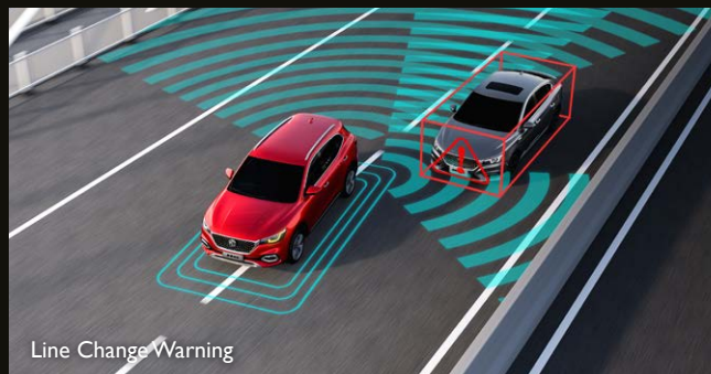
Line Change Warning