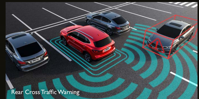
Rear Cross Traffic Warning