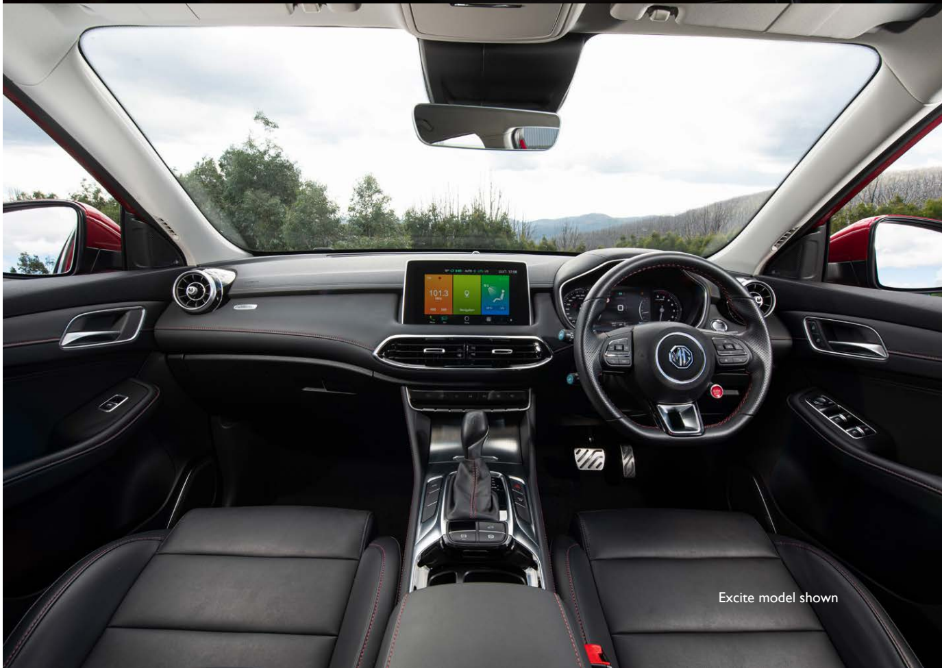
Excite model shown