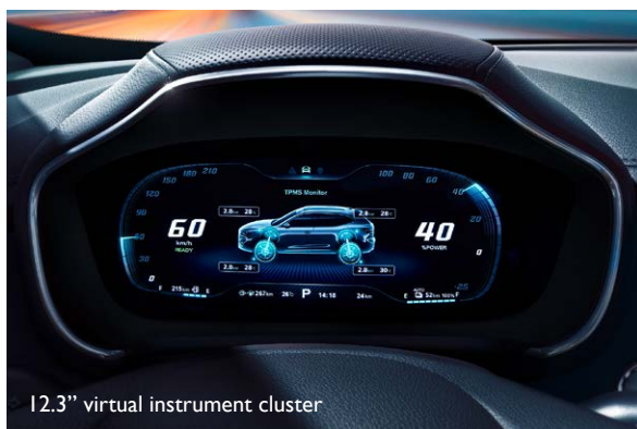
12.3" virtual instrument cluster