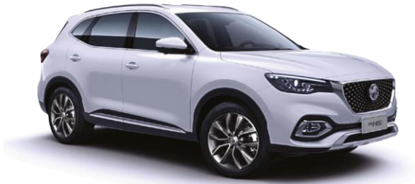
NEW PEARL WHITE METALLIC

Brighten your drive with our range of expressive MG HS colours. Choose from our considered selection of bespoke shades in both metallic and non-metallic options.