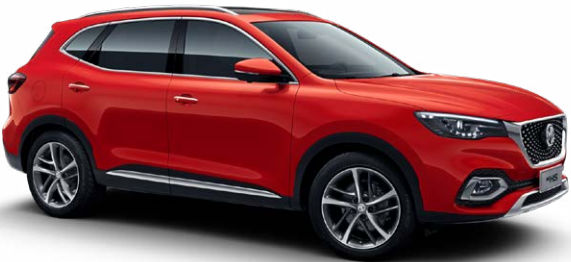
DIAMOND RED METALLIC