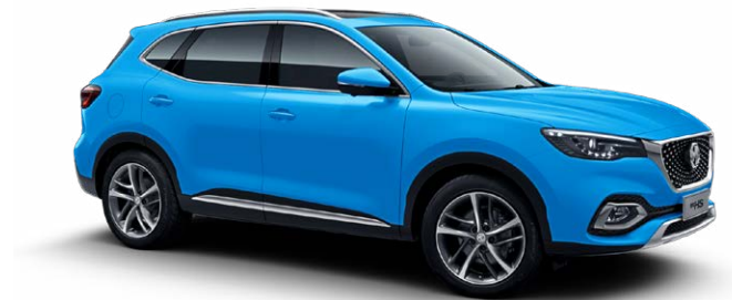
BRIXTON BLUE PREMIUM