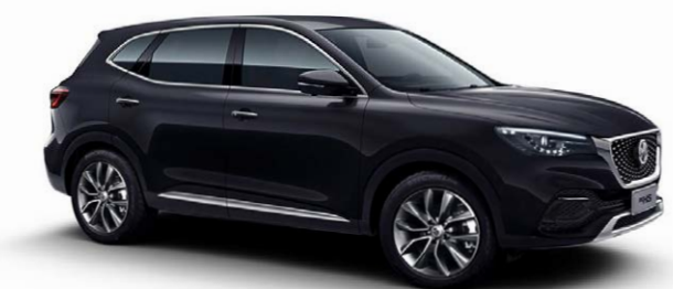
BLACK PEARL METALLIC