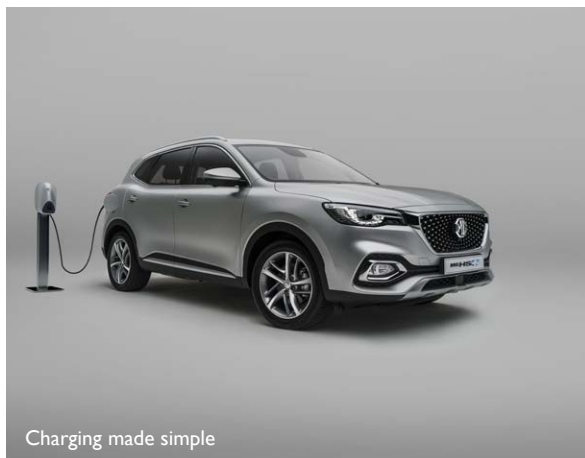
Charging made simple