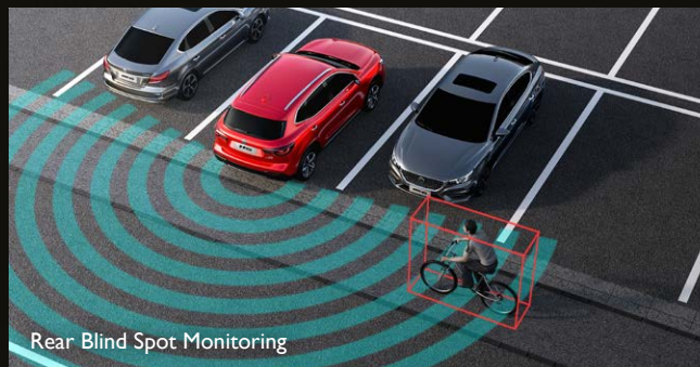
Rear Blind Spot Monitoring