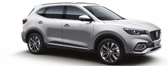
STERLING SILVER METALLIC

Colours in this brochure may vary to those on the vehicle.