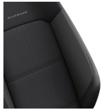
Passat Alltrack - Titan Black Cloth