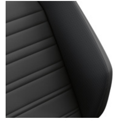
R-Line Black Nappa (Optional) Leather appointed<sup>#</sup>

#Leather appointed seats have a combination of genuine and artificial leather, but are not wholly leather.