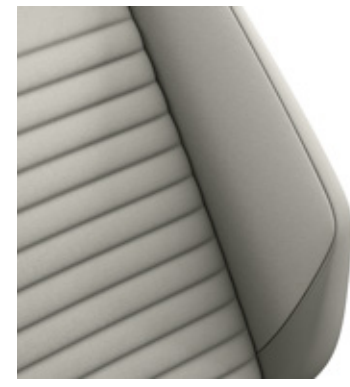
Passat Alltrack Premium - Mistral Vienna (Optional) Leather appointed<sup>#</sup>

#Leather appointed seats have a combination of genuine and artificial leather, but are not wholly leather.