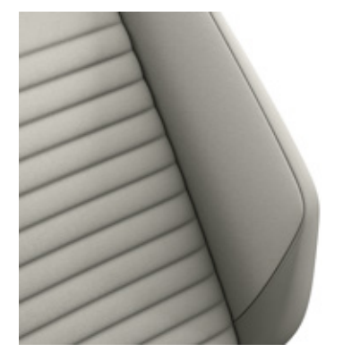
Passat Elegance - Mistral Nappa (Optional) Leather appointed<sup>#</sup>