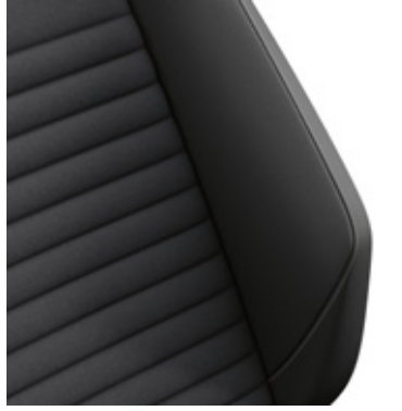
Passat Business - Titan Black Vienna Leather appointed<sup>#</sup>