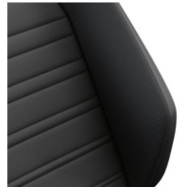
R-Line Black Nappa (Optional) Leather appointed<sup>#</sup>

#Leather appointed seats have a combination of genuine and artificial leather, but are not wholly leather.