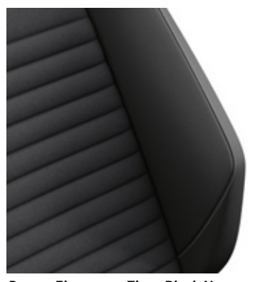
Passat Elegance - Titan Black Nappa Leather appointed<sup>#</sup>