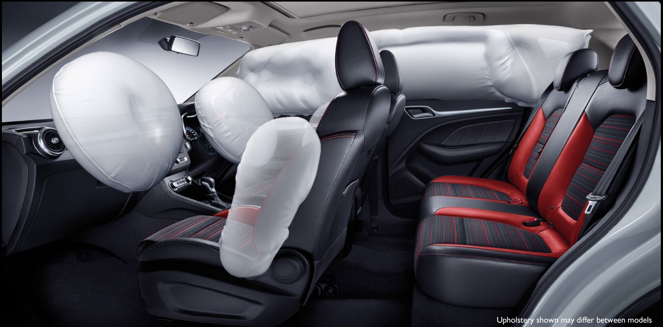
Upholstery shown may differ between models