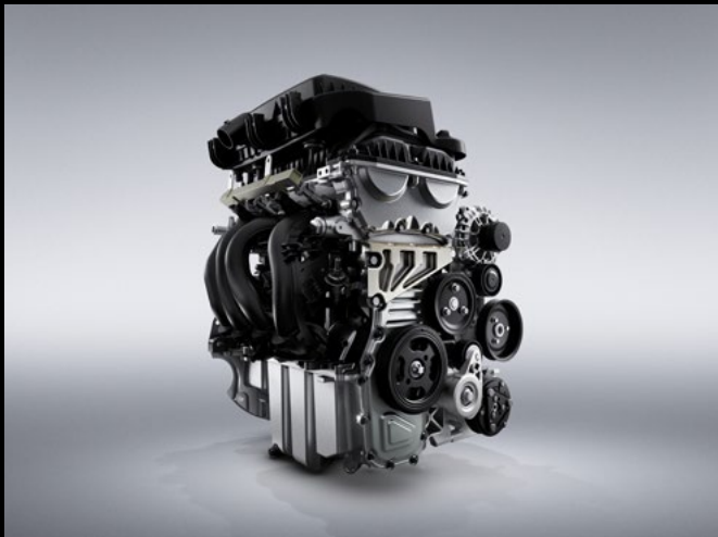
84kW 1.5L NSE Major