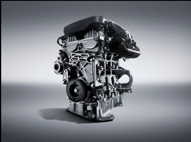
82kW 1.0T Netblue