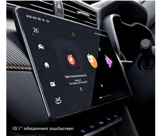
10.1" infotainment touchscreen