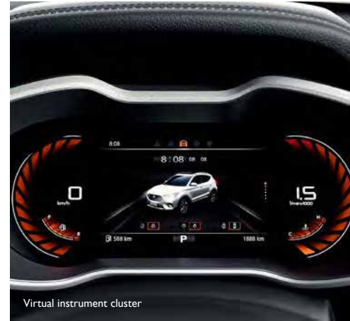
Virtual instrument cluster

Open up with one of the largest panoramic sunroofs in the small SUV segment for added elegance, luxury and viewability.