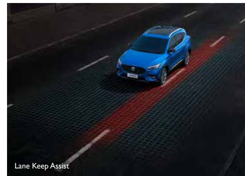
Lane Keep Assist