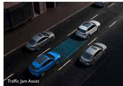
Traffic Jam Assist