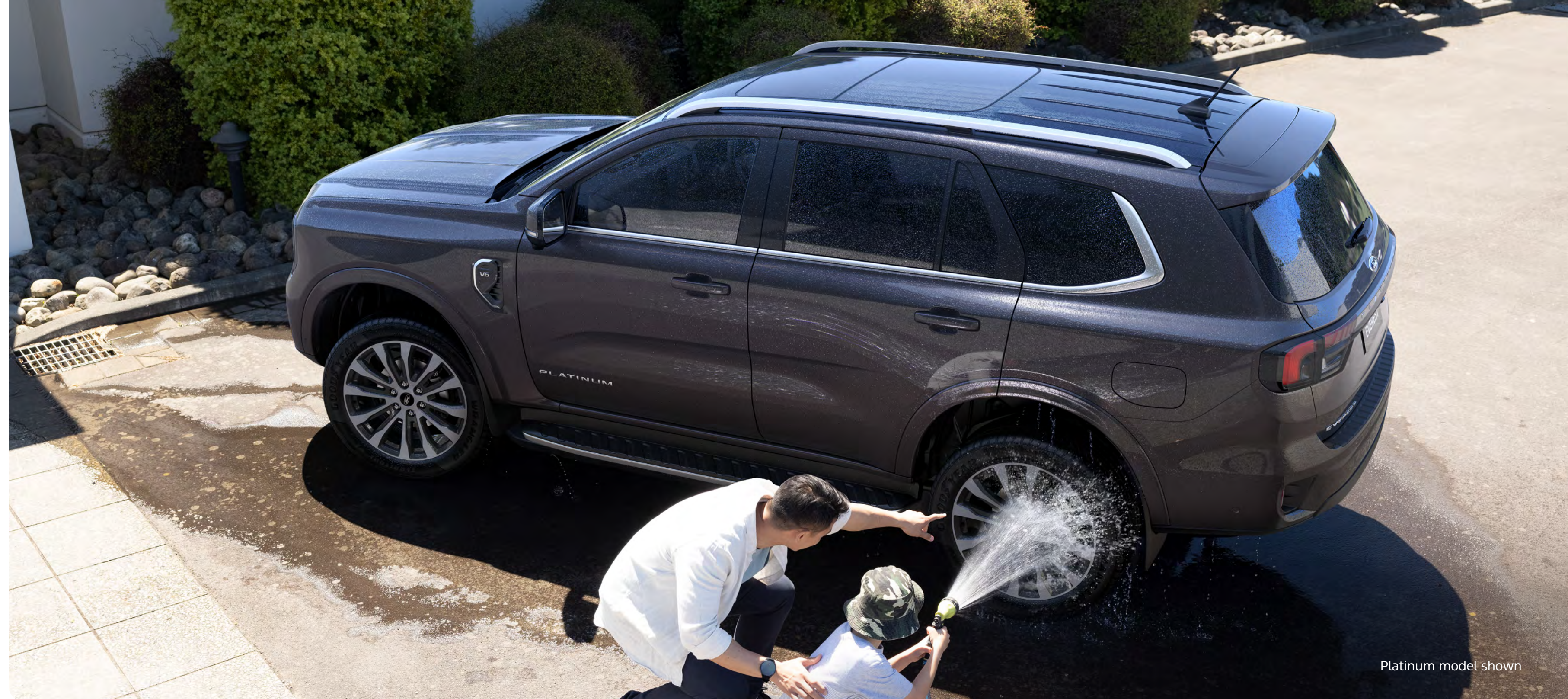
Platinum model shown

Discover the full range of Ford service benefits by visiting ford.com.au/owners/service