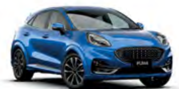
Desert Island Blue*^