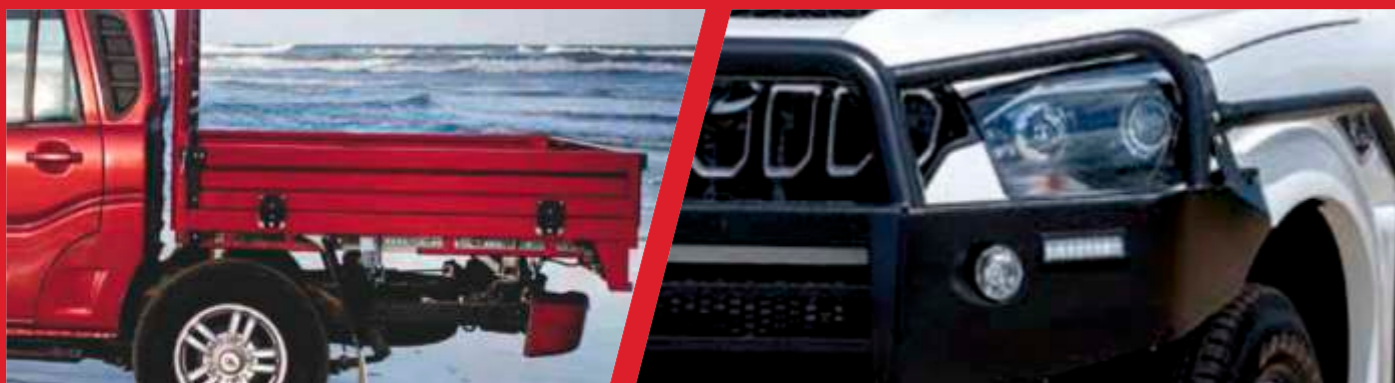
• ALUMINIUM TRAYS, GALVANISED STEEL TRAYS, COLOUR CODED STEEL TRAYS