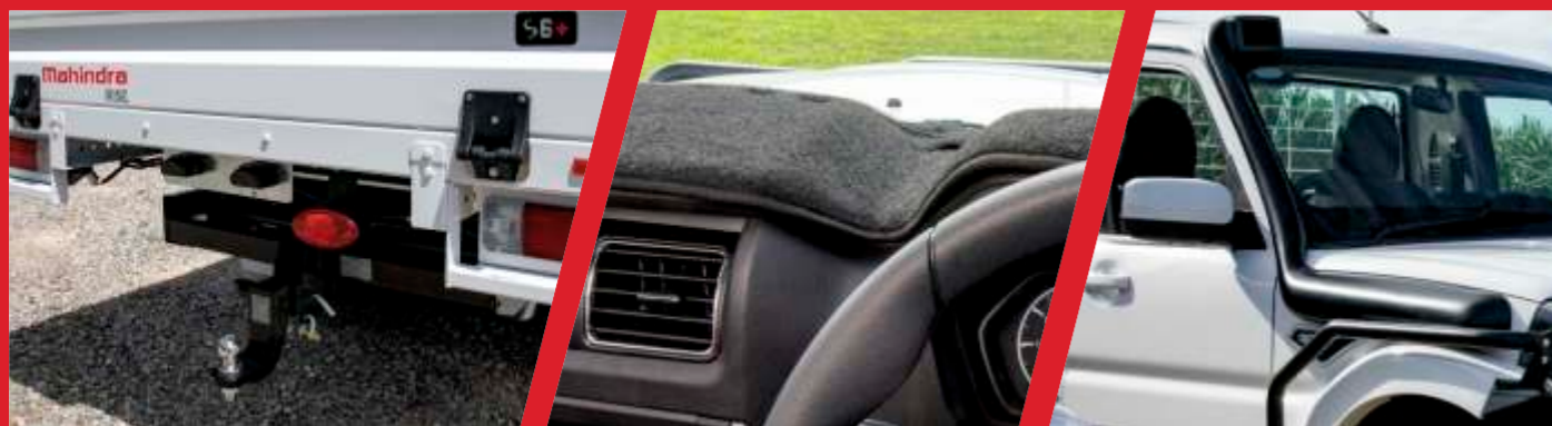
• TOW BAR