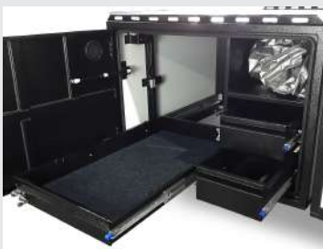
Plenty of Storage Options