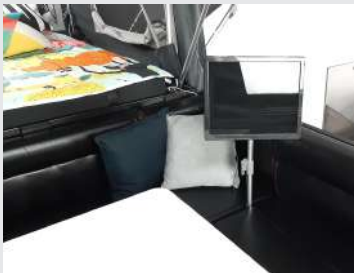
17 Inch LCD / LED Monitor & Multimedia player