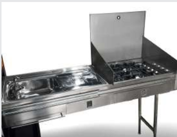
Luxury Cooking Facilities