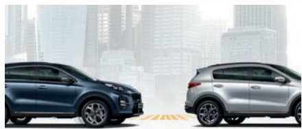
AEB Safety 1