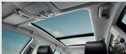
Panoramic Sunroof (GT-Line)