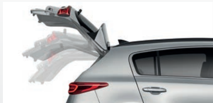
Smart Power Tailgate (SX+ & GT-Line)