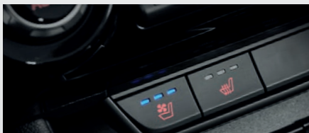
Heated and Ventilated Front Seats (GT-Line)