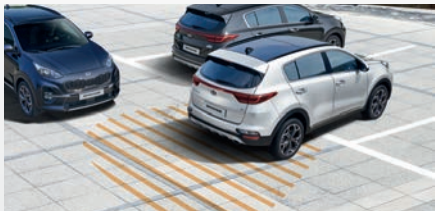
Rear Cross Traffic Alert 1 (GT-Line)