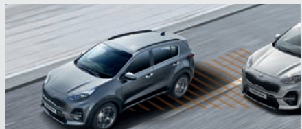
Blind Spot Detection 1 (GT-Line)