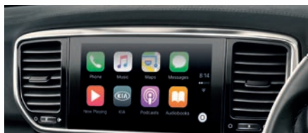
Smartphone Connectivity 2