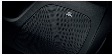
JBL® Premium Sound System (SX, SX+ and GT-Line)