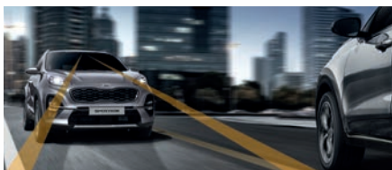
Lane Keeping Assist 1