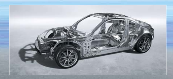
The passenger safety cell absorb and direct impact force around the cabin, rather than through it.

It has always been Subaru's purpose to design vehicles with a crucial advantage in road safety and occupant protection. While Towards Zero fatal road accidents in a Subaru vehicle by the year 2030¹ represents Subaru's ambitious future target, decades of astute observation, structural development and design research has informed the remarkable safety advances built into Subaru BRZ.