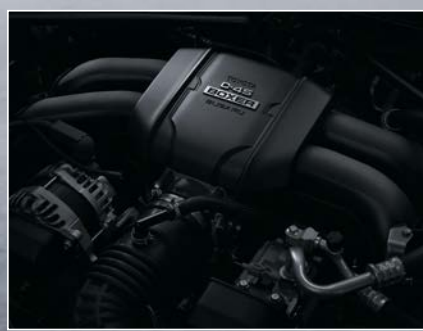
Horizontally-opposed Boxer engin

The heart and soul of Subaru BRZ owes its reputation to the intersection of two irreplaceable forces - the iconic horizontally-opposed Boxer engine and classic rear-wheel drive sports car layout. Designed to sit lower and flatter in the engine bay than traditional engines, Boxer's unique design delivers less noise and vibration to the cabin, while the lowered centre of gravity improves stability, cornering and traction with the road.