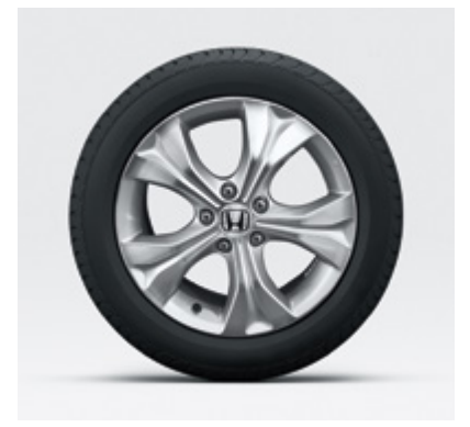
17" alloy wheels (two-tone) – VTi-L