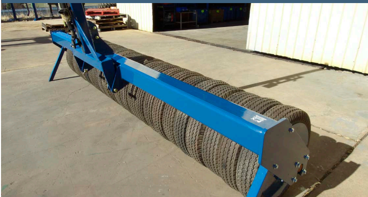
RUBBER TYRE ROLLER