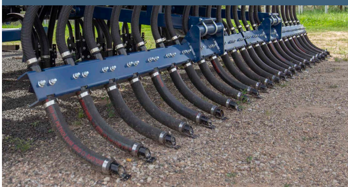
SMALL SEEDS FLEXI-CHUTE BAR