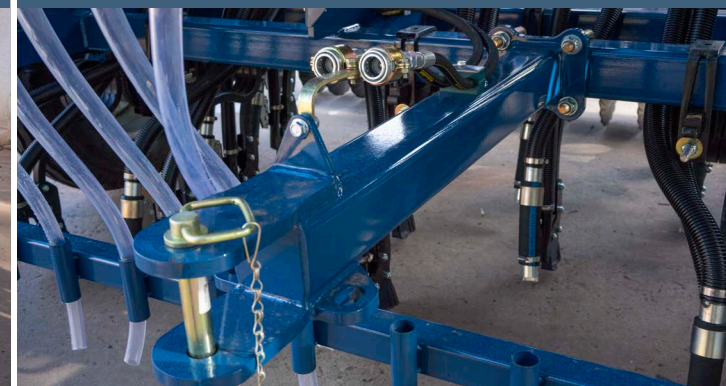
REAR TOW HITCH