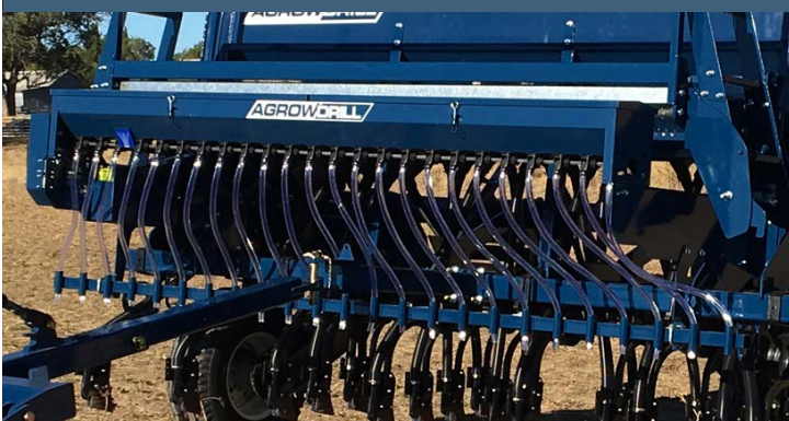
SMALL SEEDS BOX