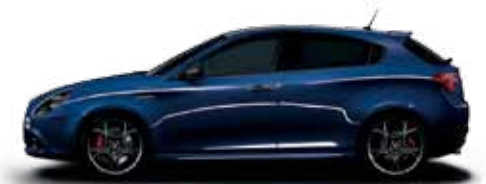
486 Anodizzato Blue Option