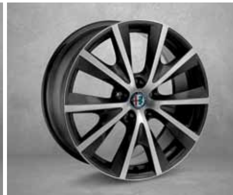
7HP - 18-Inch 5 Twin-Spoke Chrome/Burnished Alloy Wheel (Standard on Veloce)