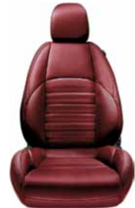
401 - Red Leather (Option on TCT Only)