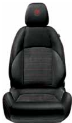
308 - Fabric & Alcantara Black & Light Grey (Linked to Veloce Pack - NAW: 764, 409)