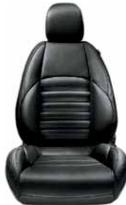
408 - Black Leather (Option on TCT Only)