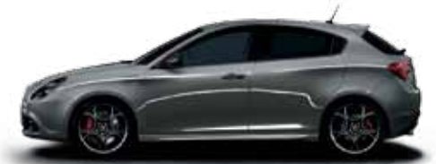
318 Stromboli Grey Option