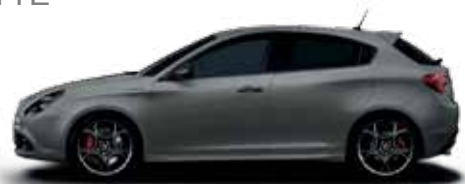
529 Magnesia Grey Option