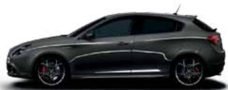
409 Lipari Grey Option