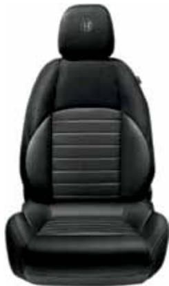
123 - Fabric Black & Dark Grey (Standard on Super)