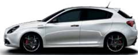
764 Perla Moonlight Option