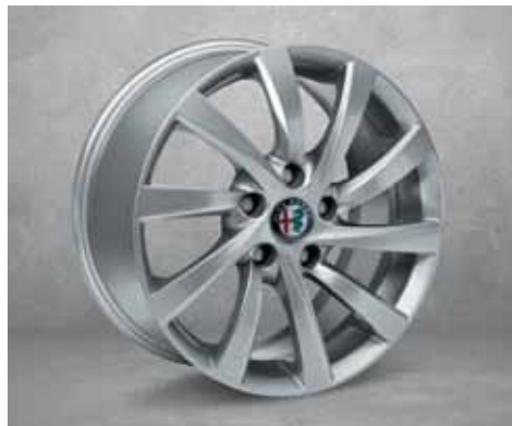
431 - 16-Inch Turbine Alloy Wheel (Standard on Super MT)