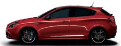
414 Alfa Red Option