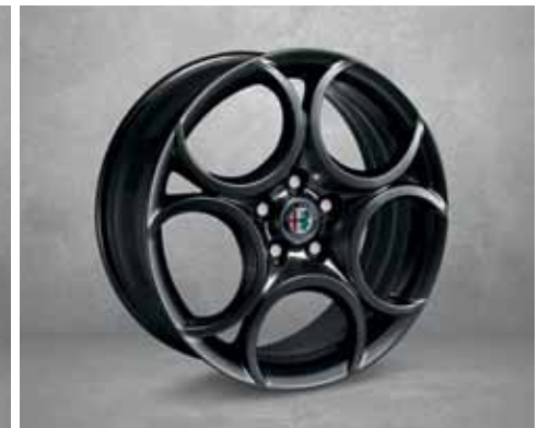
5FB - 18-Inch Black 5-Hole Alloy Wheel (Option on Veloce / Linked to Veloce Pack)