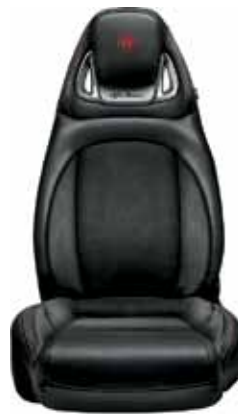
323 - Leather & Alcantara Black (Standard on Veloce)