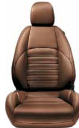
465 - Brown Leather (Option on TCT Only)