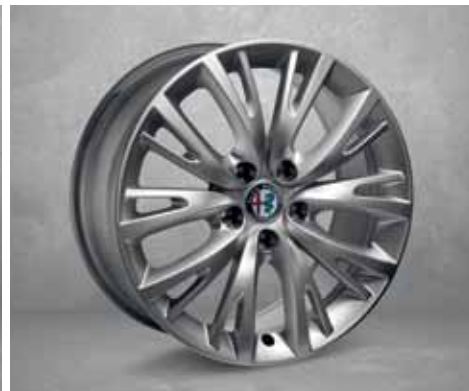
74B - 17-Inch 10 Twin-Spoke Alloy Wheel (Standard on Super TCT)