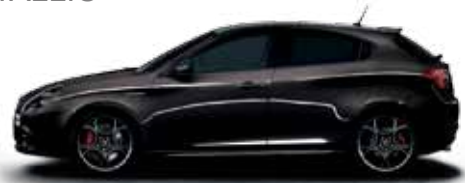
805 Etna Black Option