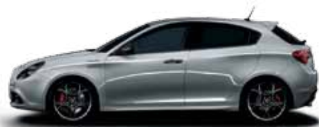
620 Silverstone Grey Option