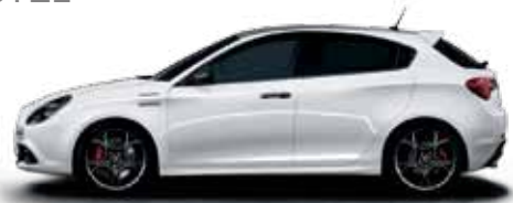
217 Alfa White Standard