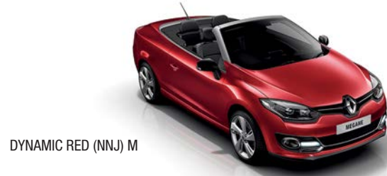
DYNAMIC RED (NNJ) M