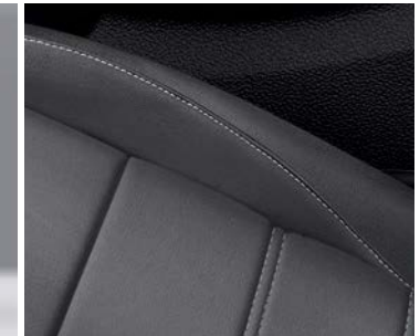
DARK CHARCOAL LEATHER UPHOLSTERY