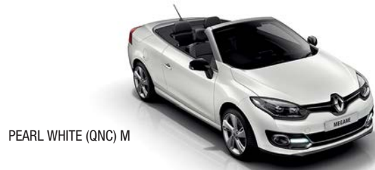
PEARL WHITE (QNC) M