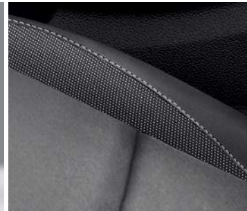
DARK CHARCOAL CLOTH WITH LEATHERETTE TRIMMED UPHOLSTERY