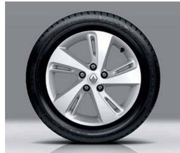
17" PLENUM ALLOY WHEELS