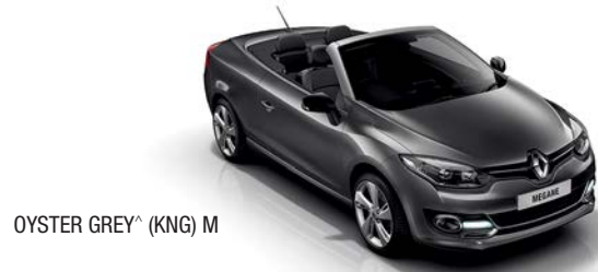
OYSTER GREY* (KNG) M