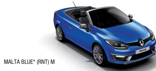
MALTA BLUE* (RNT) M