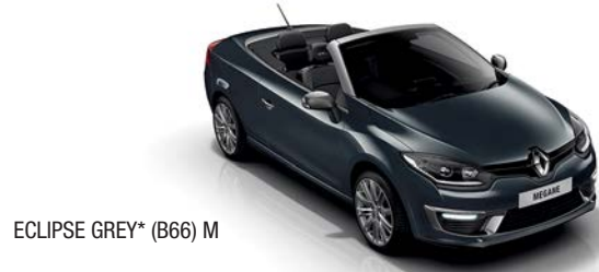
ECLIPSE GREY* (B66) M