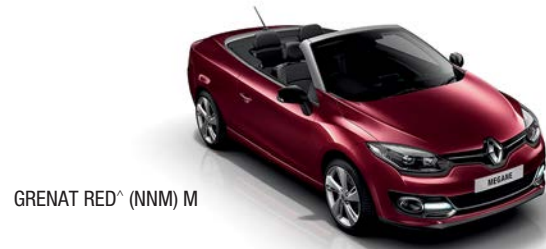
GRENAT RED^ (NNM) M