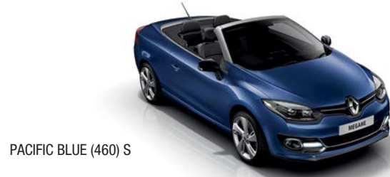
PACIFIC BLUE (460) S