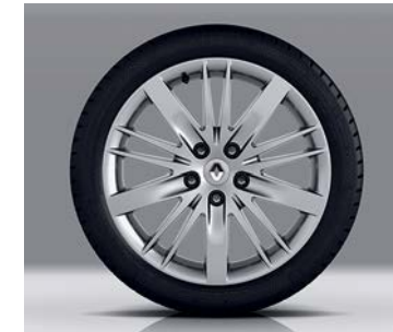
17" CELSIUM ALLOY WHEELS