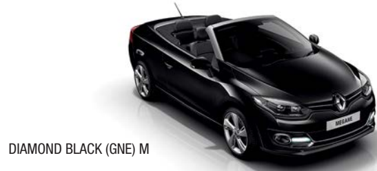
DIAMOND BLACK (GNE) M