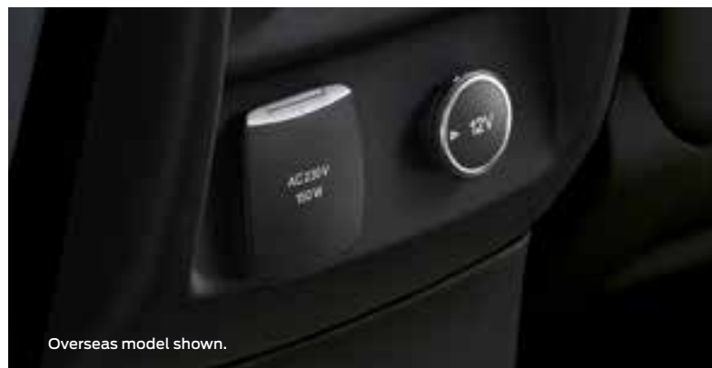
Overseas model shown.

Life doesn't stop for early mornings or late nights and with Load Box Lighting, you don't have to either. Whether it's work or play, the Load Box Lighting provides your rear tray with a clear source of illumination when you need it.