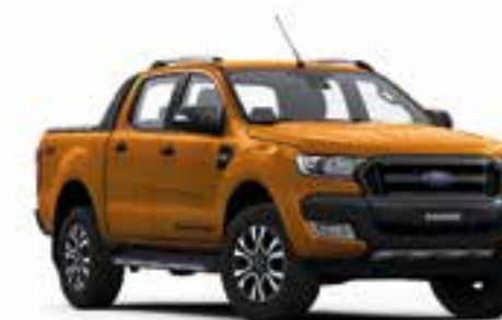
Wildtrak in Pride Orange**