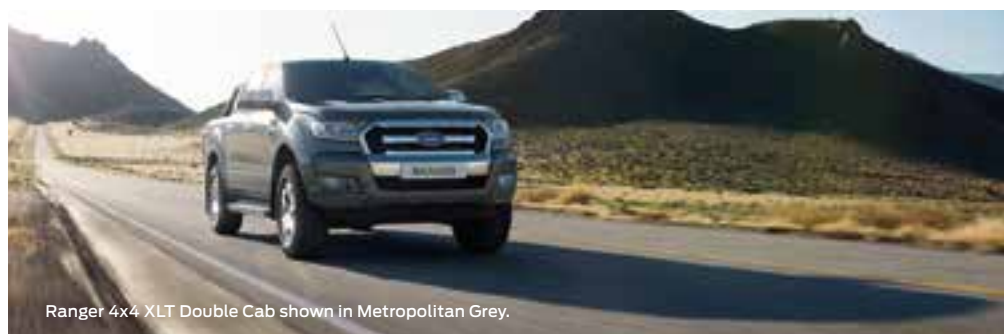
Ranger 4x4 XLT Double Cab shown in Metropolitan Grey.

It can be frustrating when the car in front of you constantly changes speed. Adaptive Cruise Control # uses radar to sense what lies ahead, and can adjust your speed to maintain a set distance from the car in front.