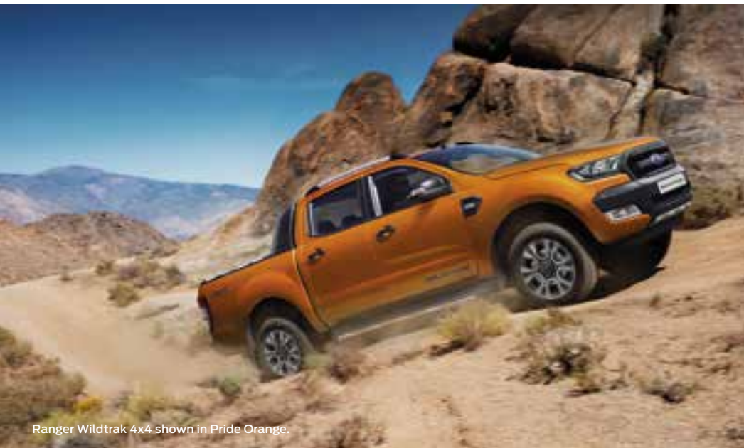
Ranger Wildtrak 4x4 shown in Pride Orange.

On the open road, weather, tight roads, even passing other drivers can cause what you're towing to sway. Trailer Sway Mitigation detects these deviations and in such an emergency, applies precise pressure to the Ranger's brakes and, if necessary reduces engine power.