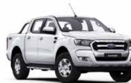
XLT in Cool White