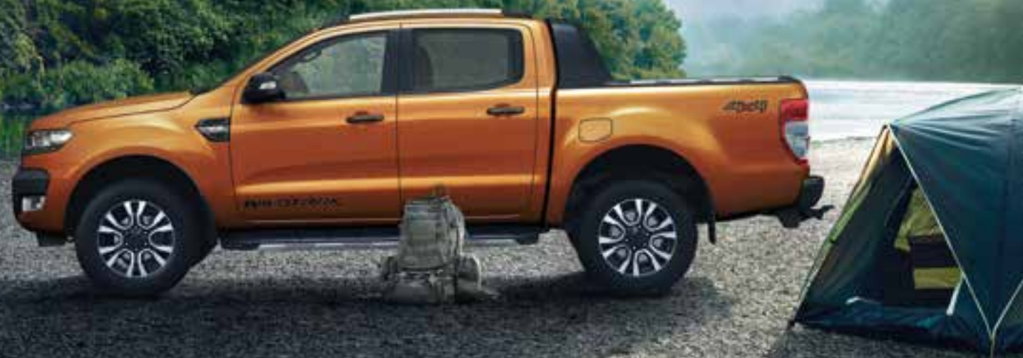
Ranger Wildtrak 4x4 shown in Pride Orange.

Ranger Wildtrak will be the most advanced truck ever seen in Australia.