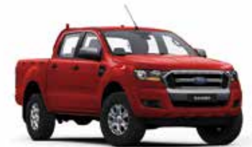
XLS in True Red ^