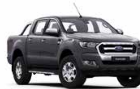
XLT in Aluminium*