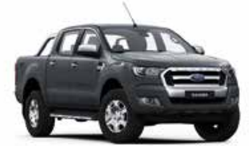
XLT in Metropolitan Grey*