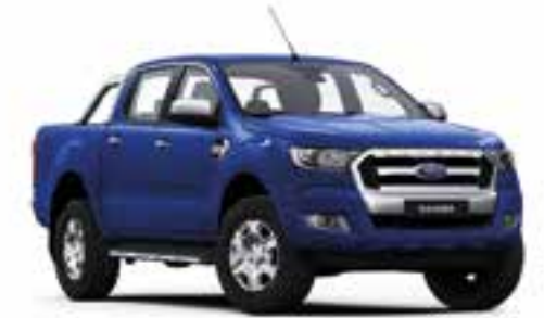
XLT in Aurora Blue* ^