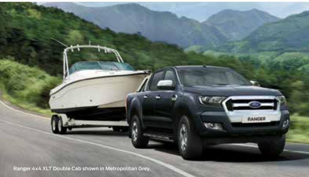
Ranger 4x4 XLT Double Cab shown in Metropolitan Grey.