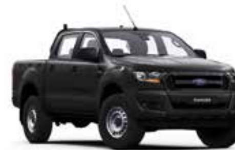
XL in Black Mica*

No extra plug-ins, no converters, no adapters. The Ranger's 230v power converter ^ makes charging simple.