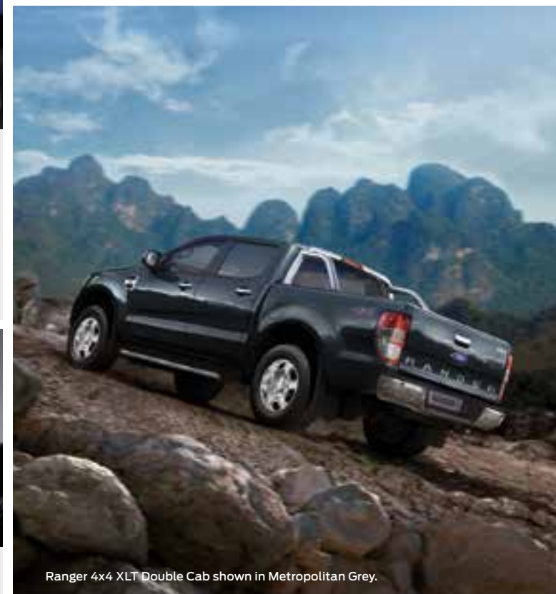
Ranger 4x4 XLT Double Cab shown in Metropolitan Grey.