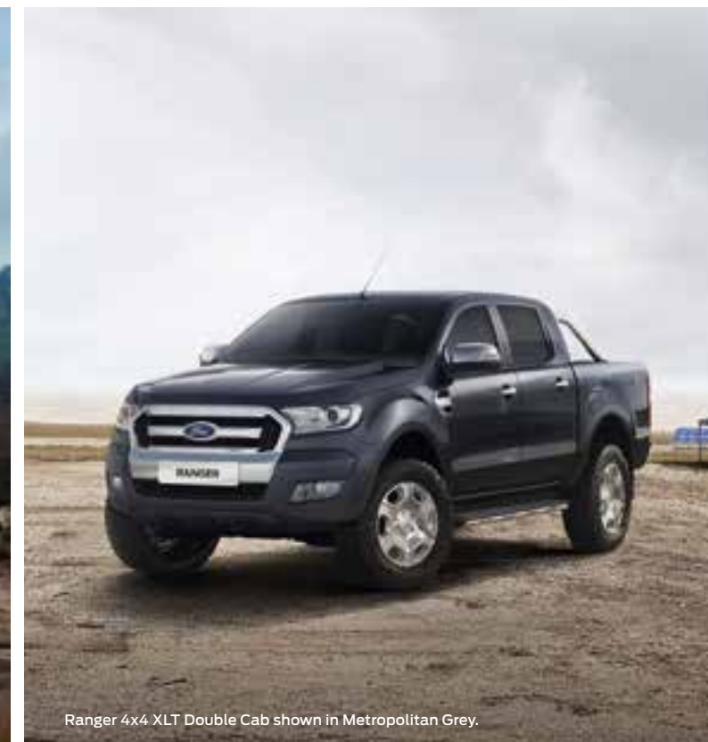
Ranger 4x4 XLT Double Cab shown in Metropolitan Grey.

With Locking Rear Differential 1 you can lock the left and right axles together with a press of a button. Which is perfect when there's little traction to be found in rough 4x4 terrain.