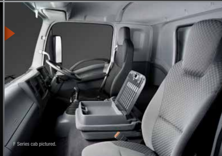
F Series cab pictured.

When you work under extreme conditions in the toughest environments, comfort is paramount. Your Isuzu cab will act as refuge, with DAVE (Digital Audio Visual Equipment), a huge interior light plus a stack of storage compartments, drink holders and more. We've also gone to great lengths to ensure our cabs are astonishingly quiet, and in the F Series, we've included the industry-leading ISRI 6860 air-suspension seat.