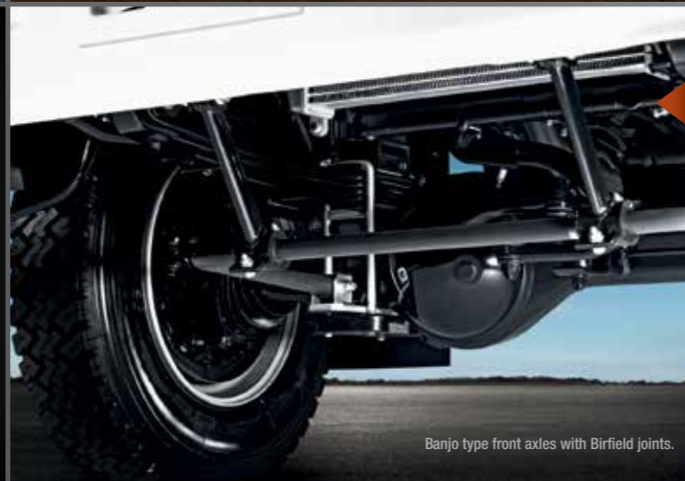
Banjo type front axles with Birfield joints.

You can rest assured that we've got the angles covered when it comes to safety. Simple 4x4 controls allow you to prepare for all terrain types, and every 4x4 model is equipped with Anti-lock Braking (ABS) and driver and passenger airbags. We've fitted special 11R22.5 tyres to every FTS model, so these along with the newly matched rear axle ratios in the automatic, result in better hill gradeability and superior downhill control. There's no need to second guess that steep slope.