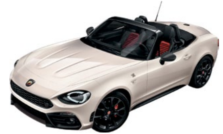
819 - Snowflake White (Tri-Coat) Option