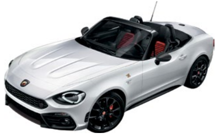
163 - Turini 1975 White (Solid) Standard