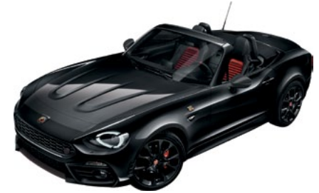
244 - San Marino 1972 Black (Metallic) Option