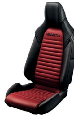
515 - Red/Black Leather with Red Stitching (Option, NAW: 816)