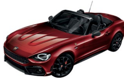
162 - Costa Brava 1972 Red (Solid) Option