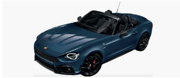
816 - Deep Crystal Blue (Metallic) Option