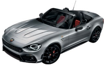
807 - Sonic Silver (Metallic) Option