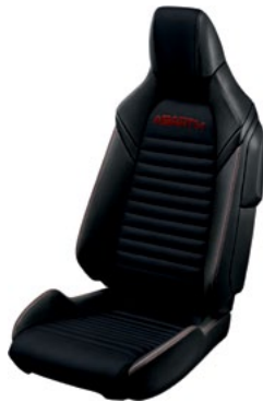
315 - Black Leather & Microfibre with Red Stitching (Standard)