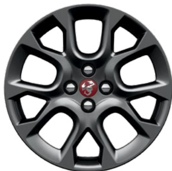
WFJ - 17-Inch Gun Metallic Wheels Standard