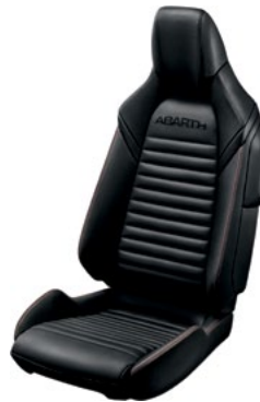
508 - Black Leather with Red Stitching (Option)