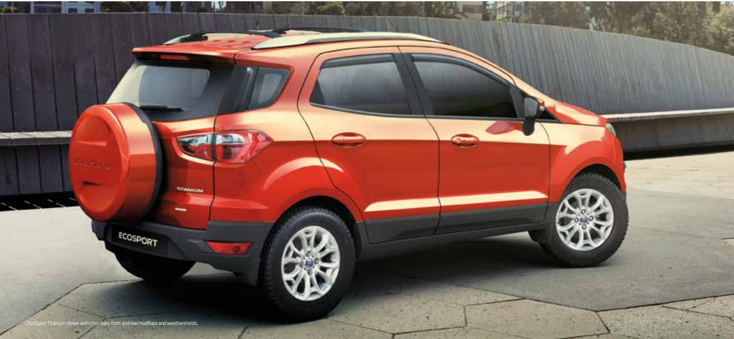
EcoSport Titanium shown with cross bars, front and rear mudflaps and weathershields.

It's not just an EcoSport – it's your EcoSport. Express yourself with a range of accessories that make any journey uniquely yours.