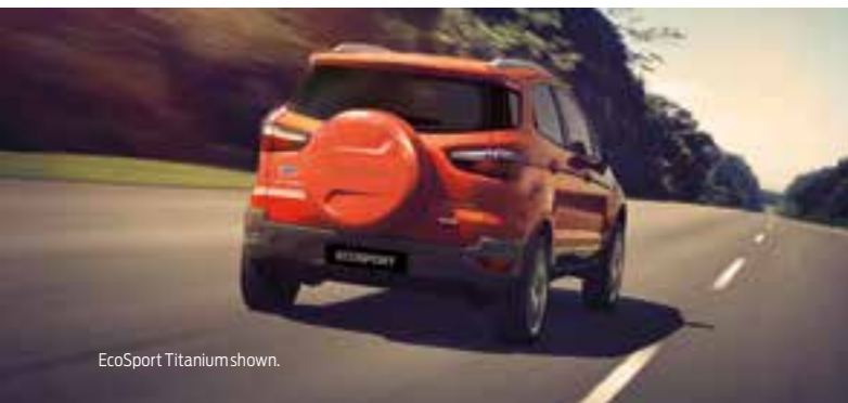
EcoSport Titanium shown.