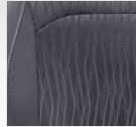
Seat insert: Shanghai cloth trim in Charcoal Black Seat bolster: Vigo cloth trim in Charcoal Black