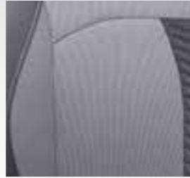
Seat insert: Dali cloth trim in Charcoal Black Seat bolster: Vigo cloth trim in Charcoal Black