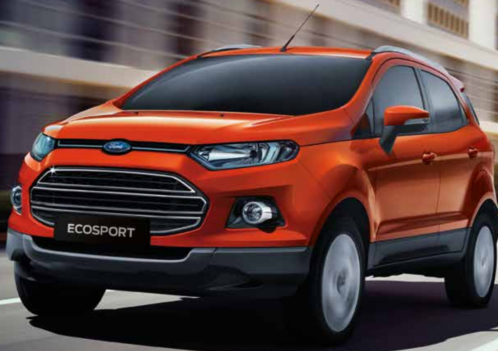
EcoSport Titanium shown.

The city can serve up plenty of challenges — potholes, narrow laneways, rough surfaces, you name it. That's why the EcoSport sits 200mm off the ground so you can tackle all of those challenges with confidence. And with its impressive power, sporty design and confidently stylish finishes, you'll be turning heads for all the right reasons.