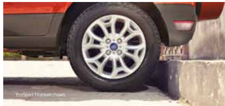
EcoSport Titanium shown.

Enjoy real peace and quiet on the road thanks to the noise reduction materials used in the EcoSport. An acoustic headliner in the roof, sound deadening materials in the roof and body, together with a double sealing system in the doors, all help to block out unwanted noise and vibrations.