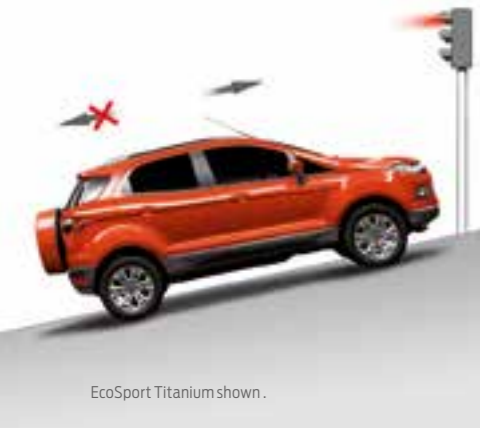
EcoSport Titanium shown.