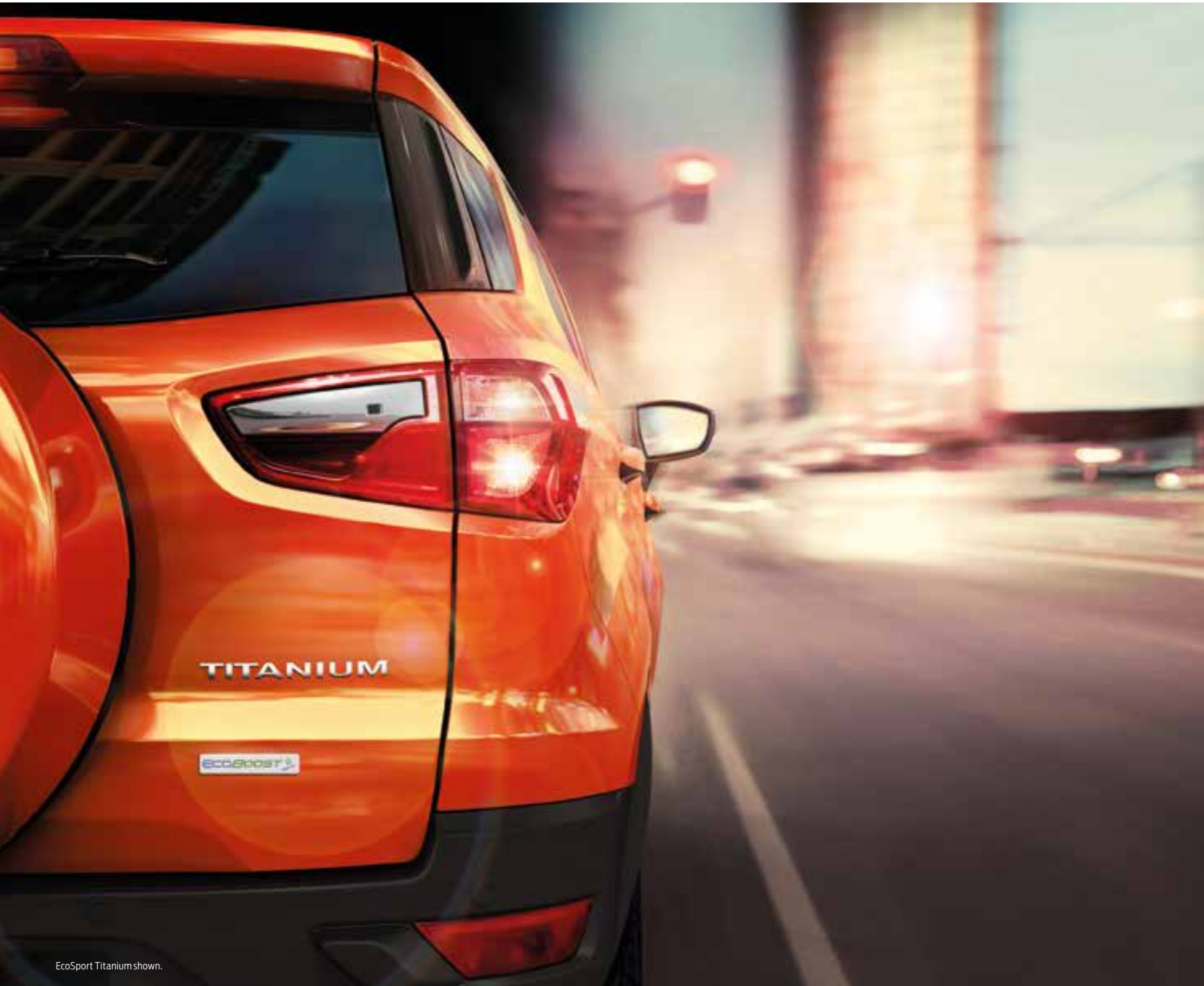
EcoSport Titanium shown.

The EcoSport is engineered to give you more of what you need, and less of what you don't. That means giving you more kilometres per tank, without compromising on responsive power. So you spend less time at the pump and more time on the road.