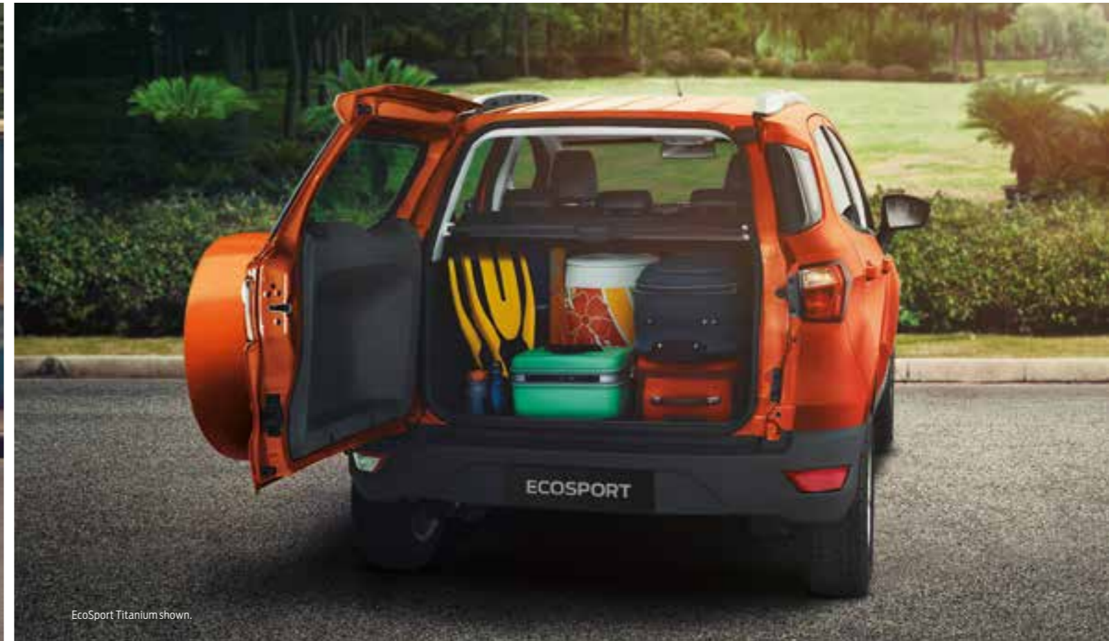
EcoSport Titanium shown.

The EcoSport is designed to be just the right size – and not only because it's compact enough to zip around the city. It's also the perfect size inside, with plenty of room to fit your life, whatever its dimensions.