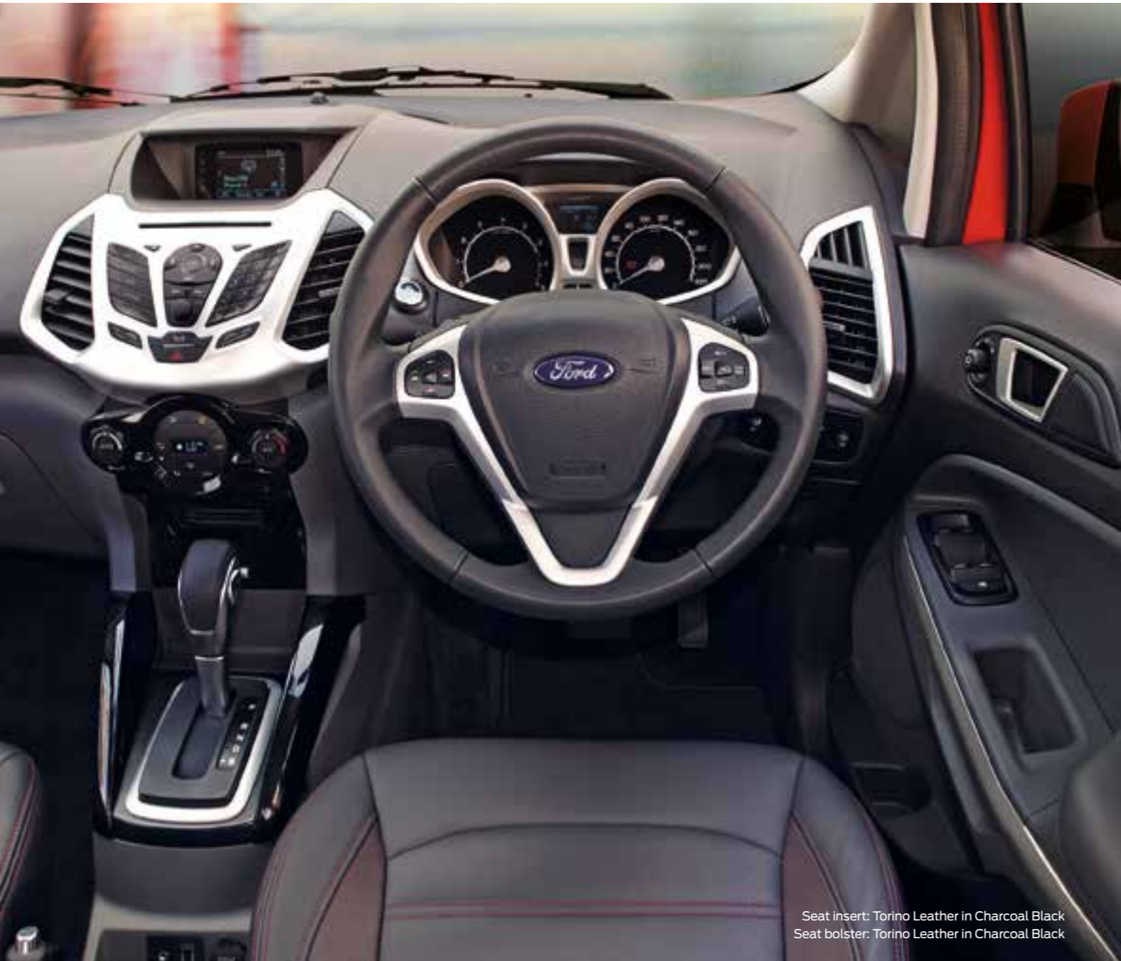
Seat insert: Torino Leather in Charcoal Black Seat bolster: Torino Leather in Charcoal Black