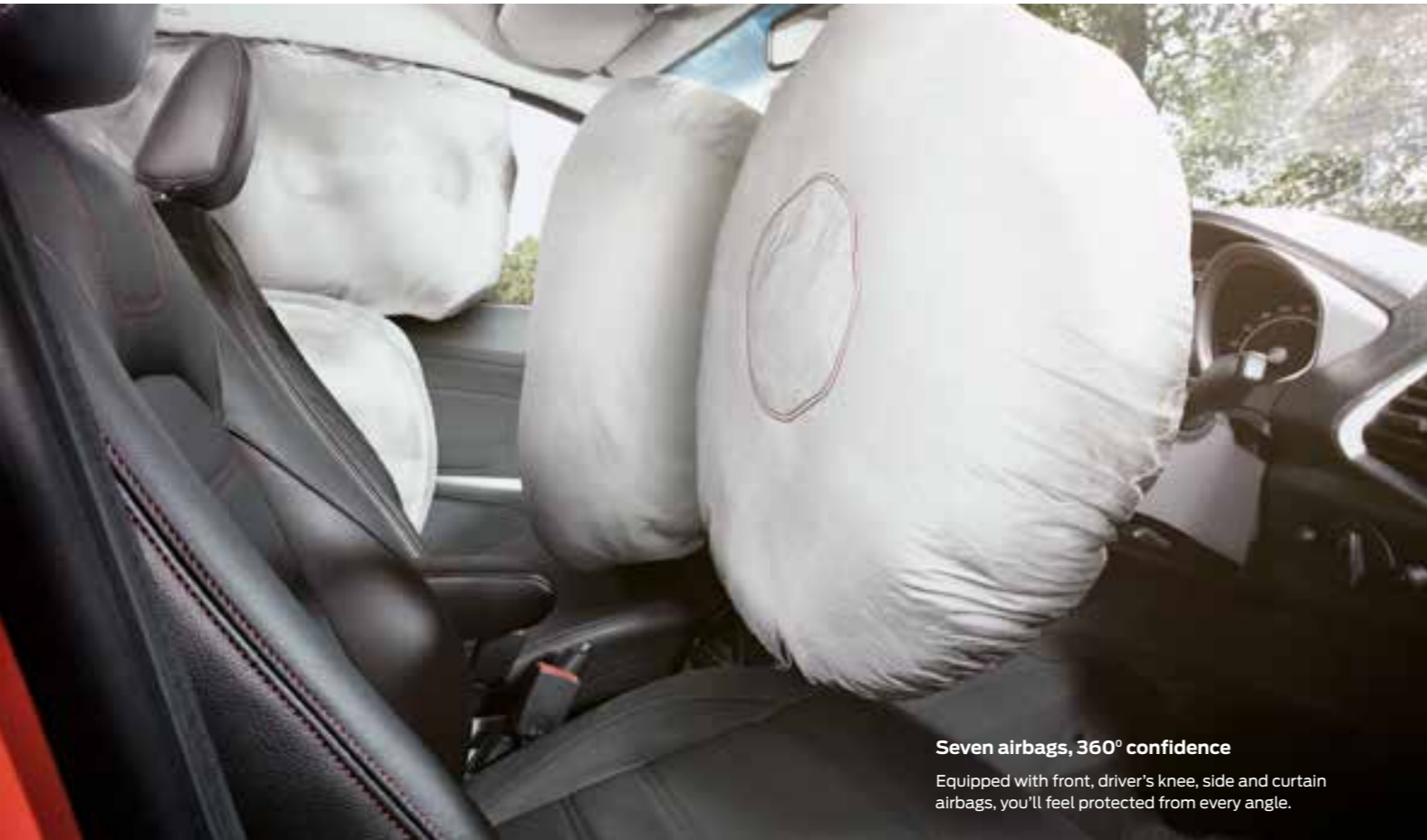
Seven airbags, 360° confidence Equipped with front, driver's knee, side and curtain airbags, you'll feel protected from every angle.