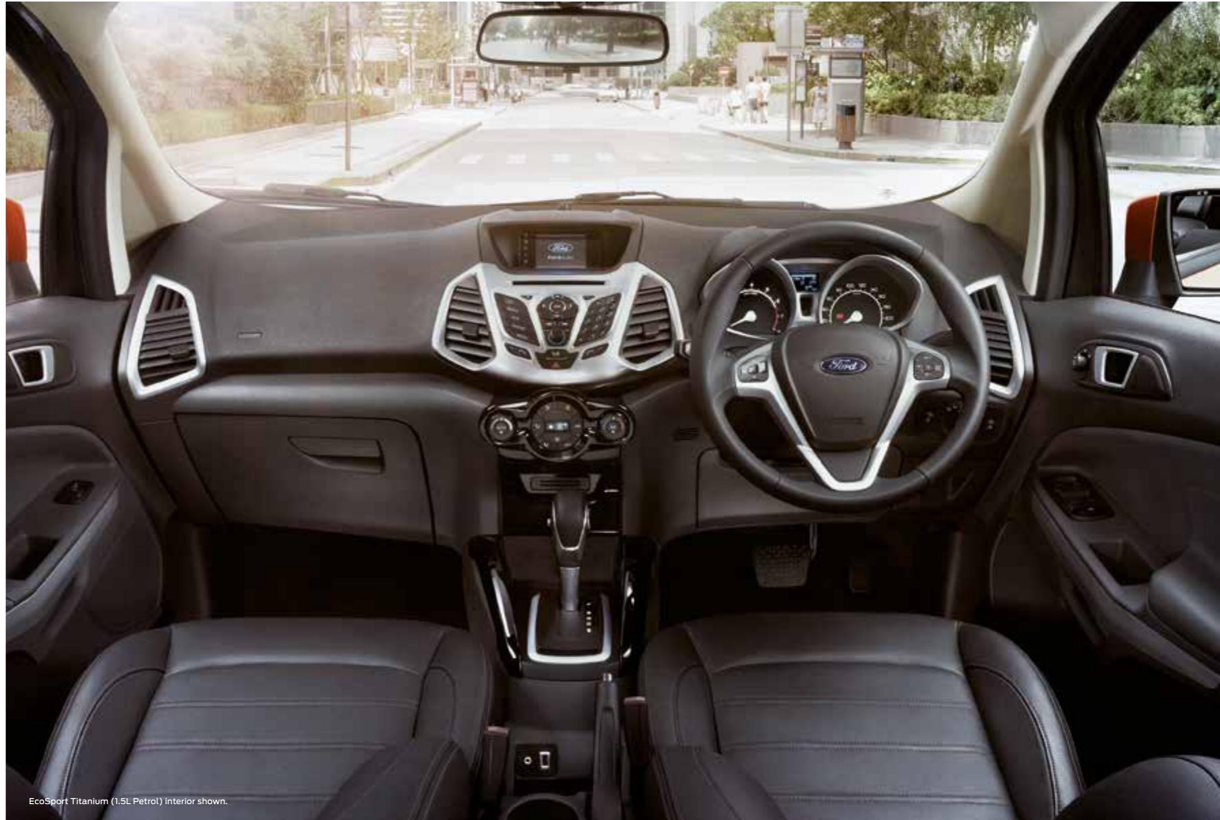
EcoSport Titanium (1.5L Petrol) interior shown.

Inside its rugged exterior, the EcoSport has a softer side. An interior that has exactly the smart, intuitive technology you need, and a touch of luxury, to help make your life run effortlessly.