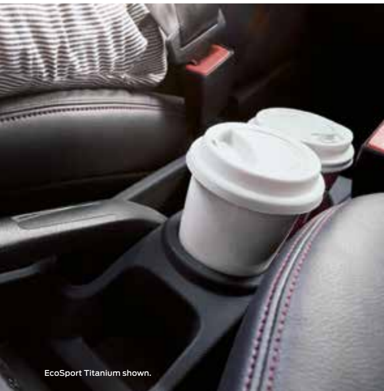
EcoSport Titanium shown.