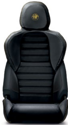
440 - Black Leather with Yellow Stitching