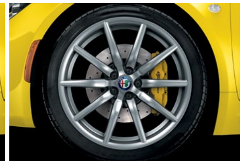
55E - 18/19-Inch Spider Design Alloy Wheels (Option - Spider)