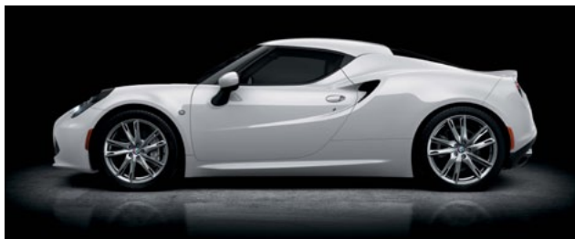
5CA - Alfa White (Pastel) Standard