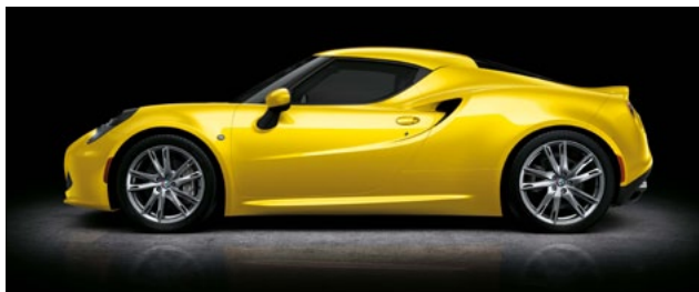
4H5 - Modena Yellow (Pastel) Option