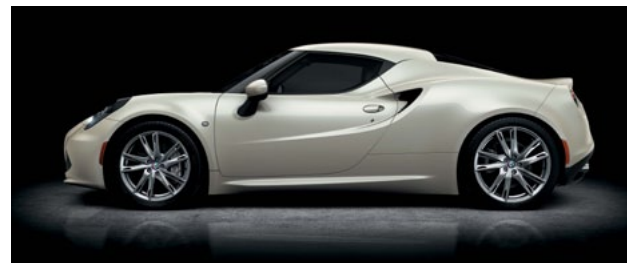
6FW - Madreperla White (Tri-Coat) Option