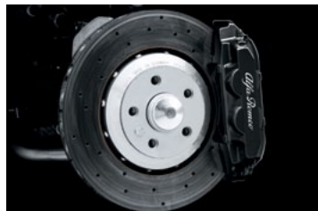
4SU - Black Brake Calipers (Option)