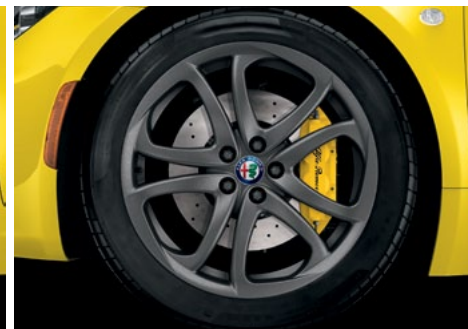
439 - 17/18-Inch 5-Triangle-Spoke Alloy Wheels with Dark Finish (Option - Spider)