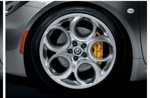
421 - 18/19-Inch 5-Disc Alloy Wheels (Option - Coupe)