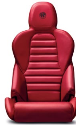
732 - Red Leather