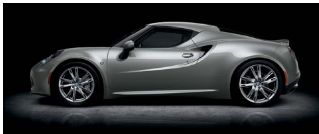
210 - Basalt Grey (Metallic) Option