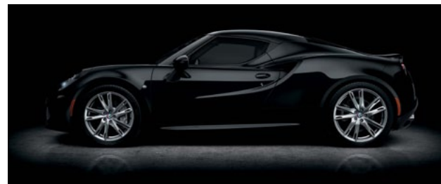
5CB - Alfa Black (Pastel) Option