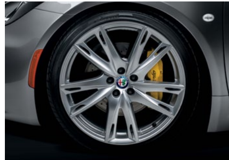
431 - 17/18-Inch 5 Twin-Spoke Alloy Wheels (Standard - Coupe)