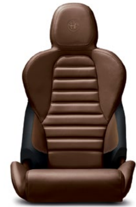
727 - Brown Leather