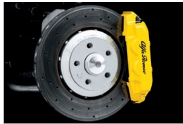
4TA - Yellow Brake Calipers (Option)