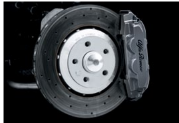
Grey Brake Calipers (Standard)