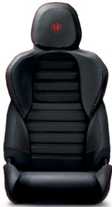
430 - Black Leather with Red Stitching