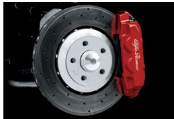
4TB - Red Brake Calipers (Option)