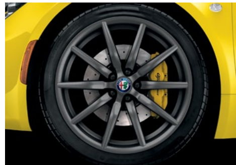
5A6 - 18/19-Inch Dark Spider Design Alloy Wheels (Option - Spider)