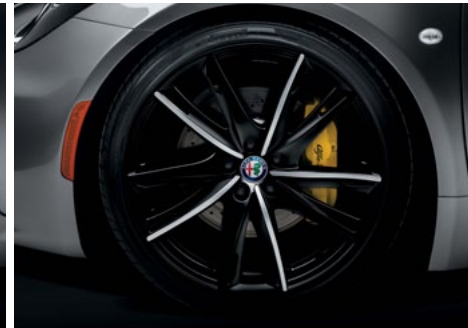
433 - 17/18-Inch Twin-Spoke Alloy Wheels with Matte Black Diamond Finish (Option - Coupe)