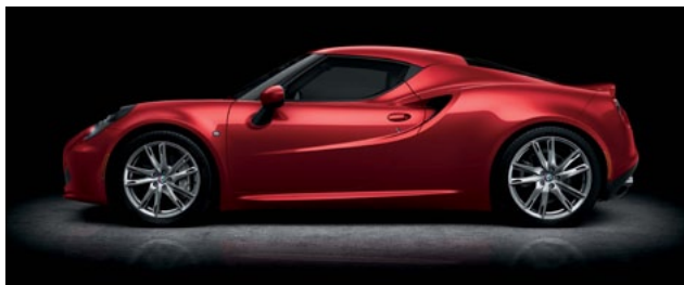
5JQ - Competizione Red (Tri-Coat) Option