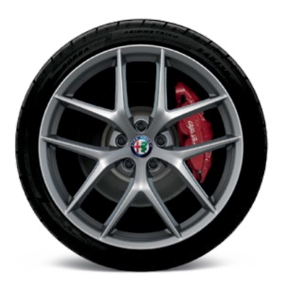
5A6 - 20" Sport Alloy Wheel (Standard on Ti)