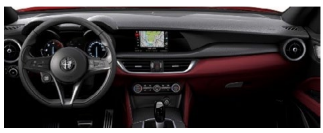
422 - Sports Seats in Red Leather with Matching Trim (Option on Stelvio / Standard on Ti)