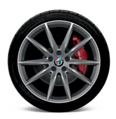
5FB - 19" 10-Spoke Alloy Wheel (Standard on Stelvio)