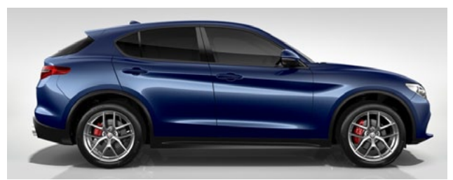
092 Montecarlo Blue Option