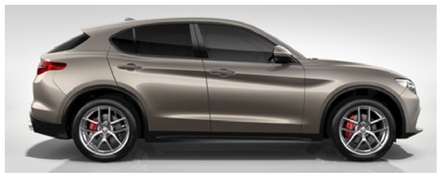
082 Imola Titanium Option