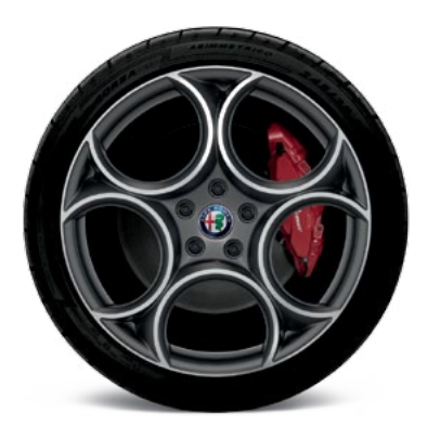
5EV - 19" Dark 5-Hole Alloy Wheel (Option on Stelvio)