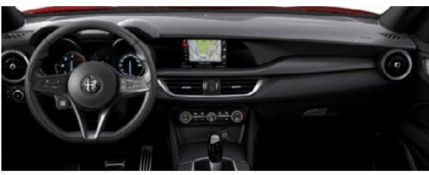
423 - Sports Seats in Black Leather with Matching Trim (Option on Stelvio / Standard on Ti)