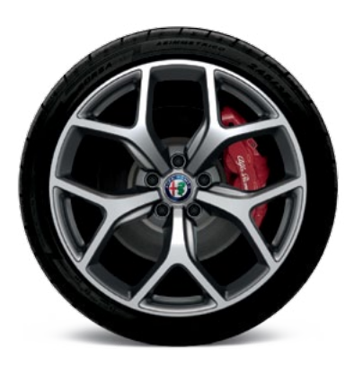
6G7 - 19" Sport 2 Alloy Wheel (Standard - First Edition)