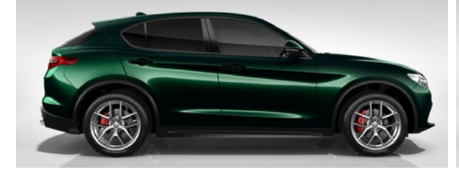
800 Racing Green Option